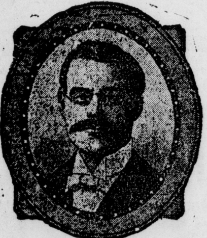
CYRIL ARTHUR PEARSON. (Famous English Editor Now Visiting the United States.)

Cyril Arthur Pearson, who is now visiting this country for the purpose of studying American journalism and its methods, is only 35 years old, but has already made several millions by his enterprise and ingenuity in the newspaper line. He began his career a few years ago as a writer on the staff of London Tit-Bits. He had just come out of Winchester school with nothing behind him save his father's blessing and nothing before him but the severest and of competition. After working