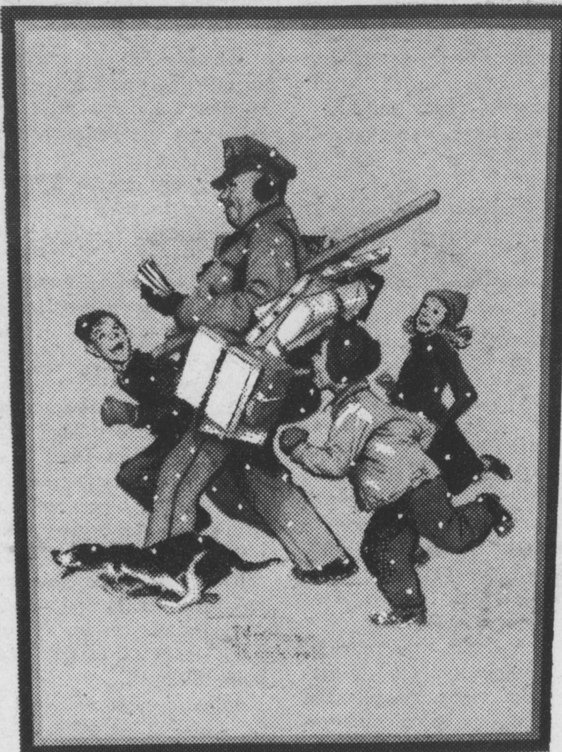
JOLLY POSTMAN by Norman Rockwell.