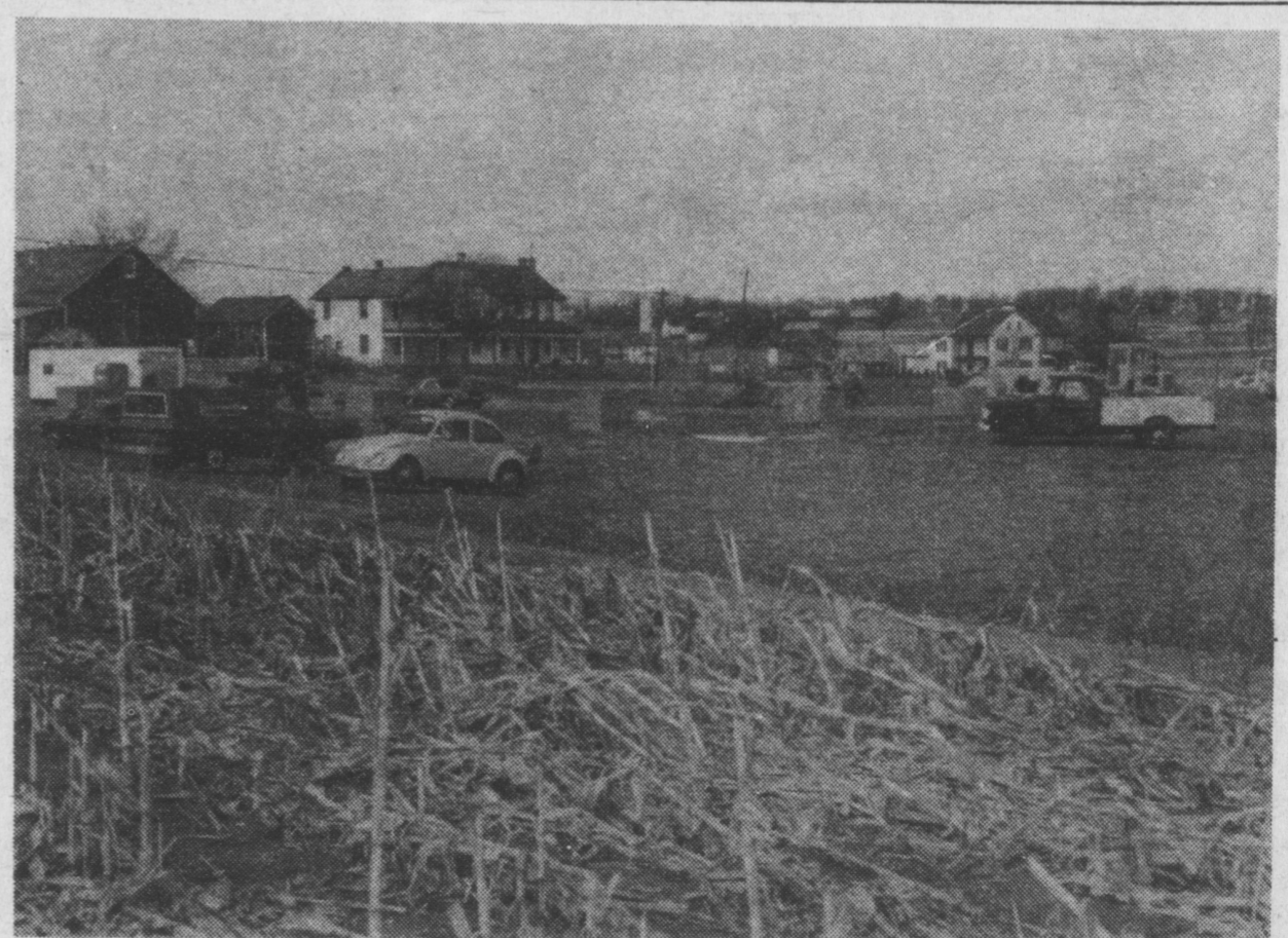
Carlos R. Leffler Inc. is constructing a new terminal in the Mount Joy area. The Texaco Fuel Oil distributor is building on Cloverleaf Road, 3/10 of a mile east of Route 283 in Mount Joy Township. The distributor, presently serving Lebanon, Lancaster and Berks Counties, has over 22,000,000 gallons of fuel storage and offers fuel oil delivery and burners. Carlos R. Leffler Inc. has been in business since 1941.

He will also take requests on Monday and Tuesday, Dec. 22 and 23, from 6:30 to 9:00 pm.