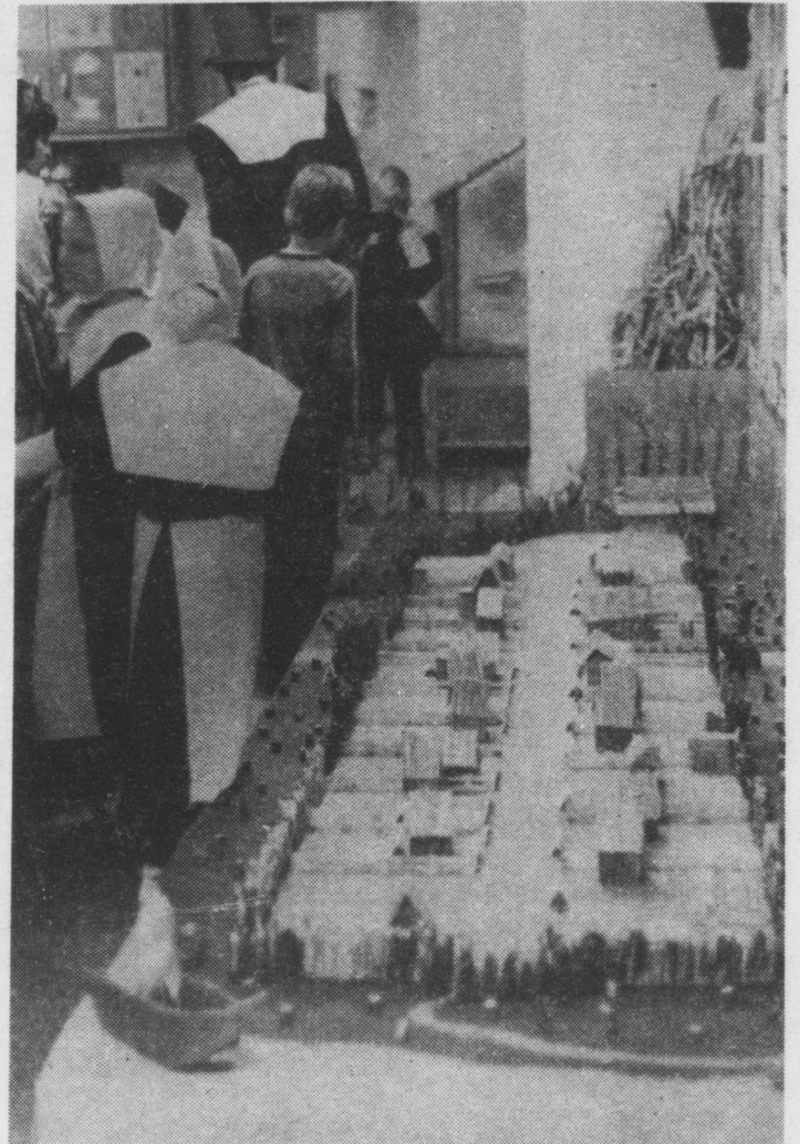
The student constructed replica of Plymouth Plantation.

Students presented a program of skits including: "Now and Then," "The