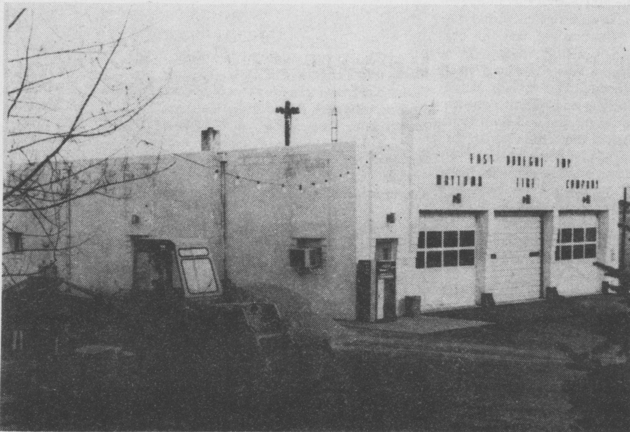
Work began last week on the $130,000 addition to the Maytown-East Donegal fire hall. The new addition will house an ambulance bay, meeting and dining room and lounge.