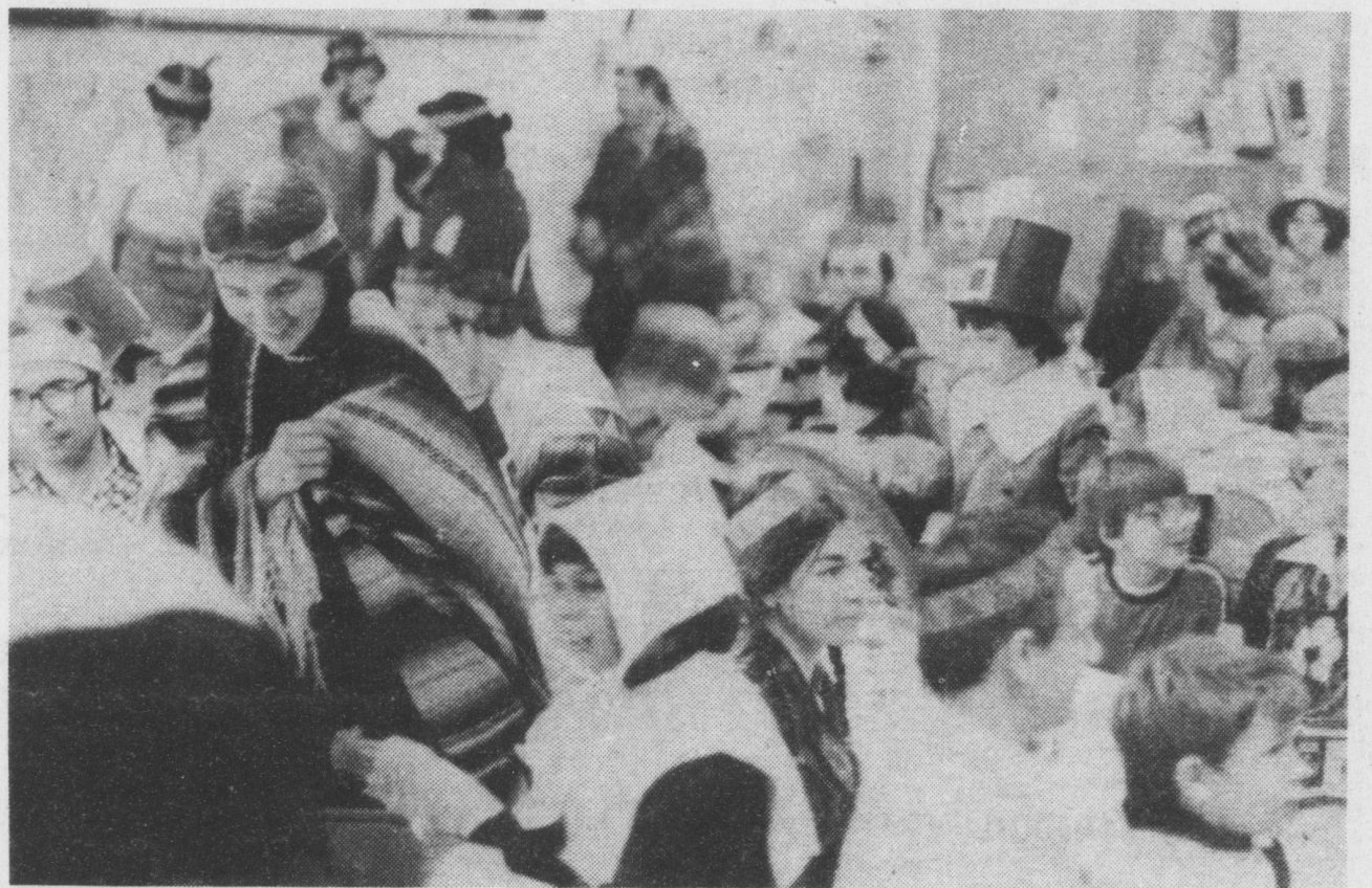
Students at Kraybill's Mennonite School, Mount Joy, had an unusual Thanksgiving Feast when the students' parents arrived in Indian garb. The students were dressed as Pilgrims.

Heat the milk to a scalding temperature. Stir in corn meal and heat for 20 minutes, stirring occasionally. Remove from heat and add the remaining ingredients. Bake at 325 degrees for 2 hours.