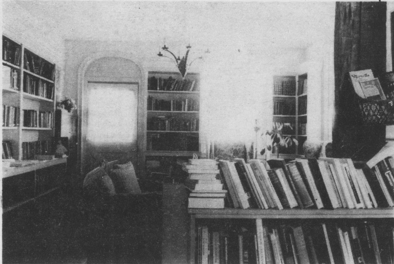
Interior of "The Study"