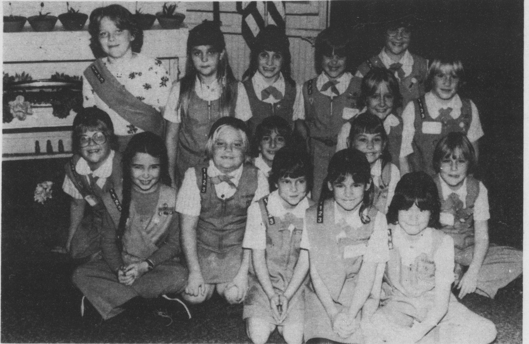
Brownie Troop #1123 from Mount Joy