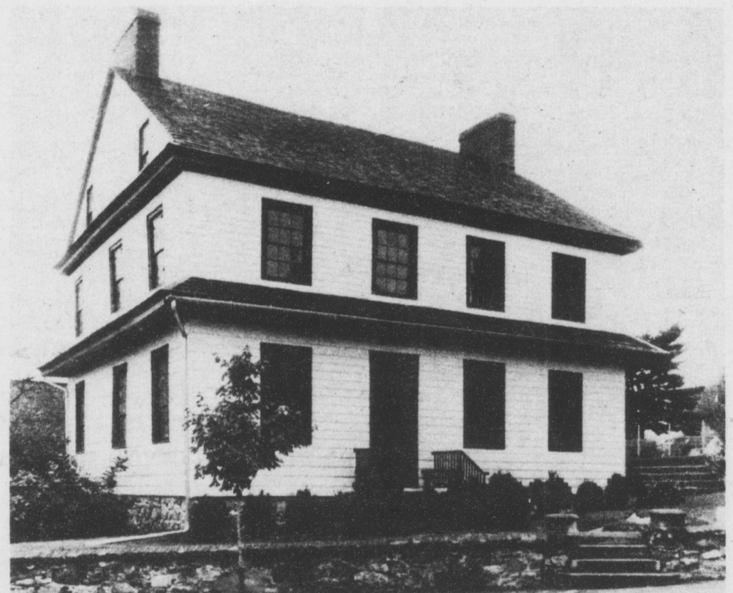
The Sultzbach-Rinehart House in Marietta