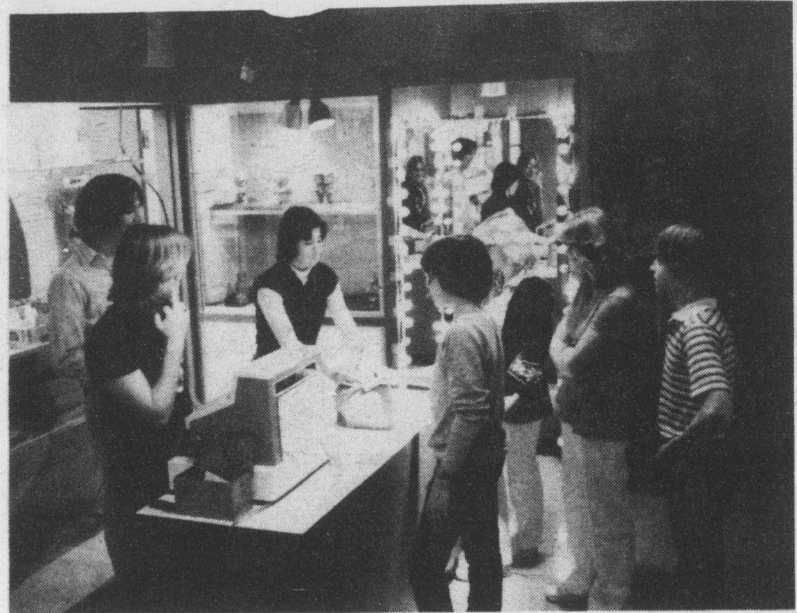
Distributive Education students gaining experience in Sales and Marketing.