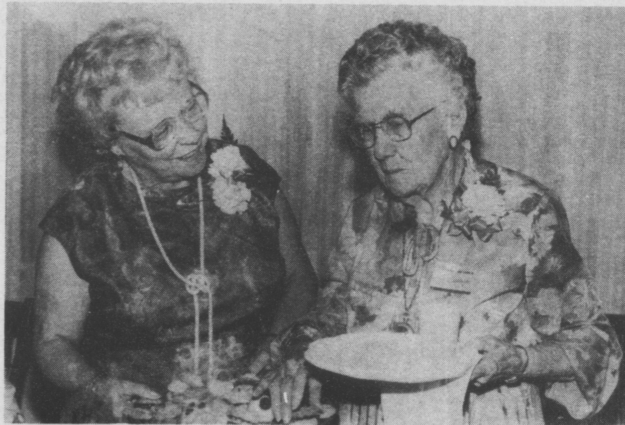
The Schock Presbyterian Home, 37 East Main Street, Mount Joy, was the scene of an annual Harvest Home open house and tea last Sunday. Residents had a chance to show off their many crafts and projects to the many guests who filtered through the home between 2 and 4 in the afternoon. On display was a huge map of the United States, tracing with yarn the travels of all Schock residents. Cookies, tea, funnel cakes and popcorn were also served to guests and residents.