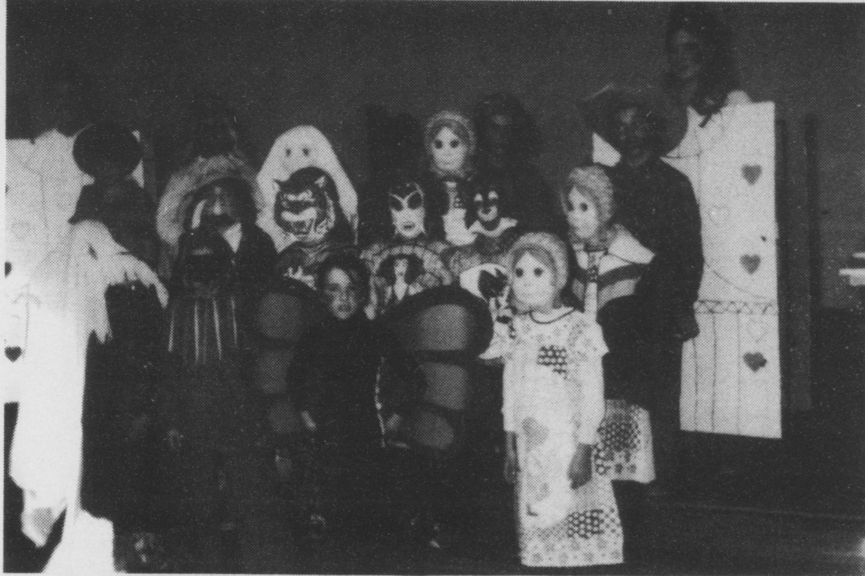
Brownie Troop #29, Mount Joy, held a Halloween party at its meeting place, Grandview Elementary Cafeteria, and the girls were surprised with a Mexican "Pinata" filled with small gifts. The girls hit it with a stick until the covering was opened and the gifts spilled unto the floor. Members of the troop were in costumes, and refreshments were served.