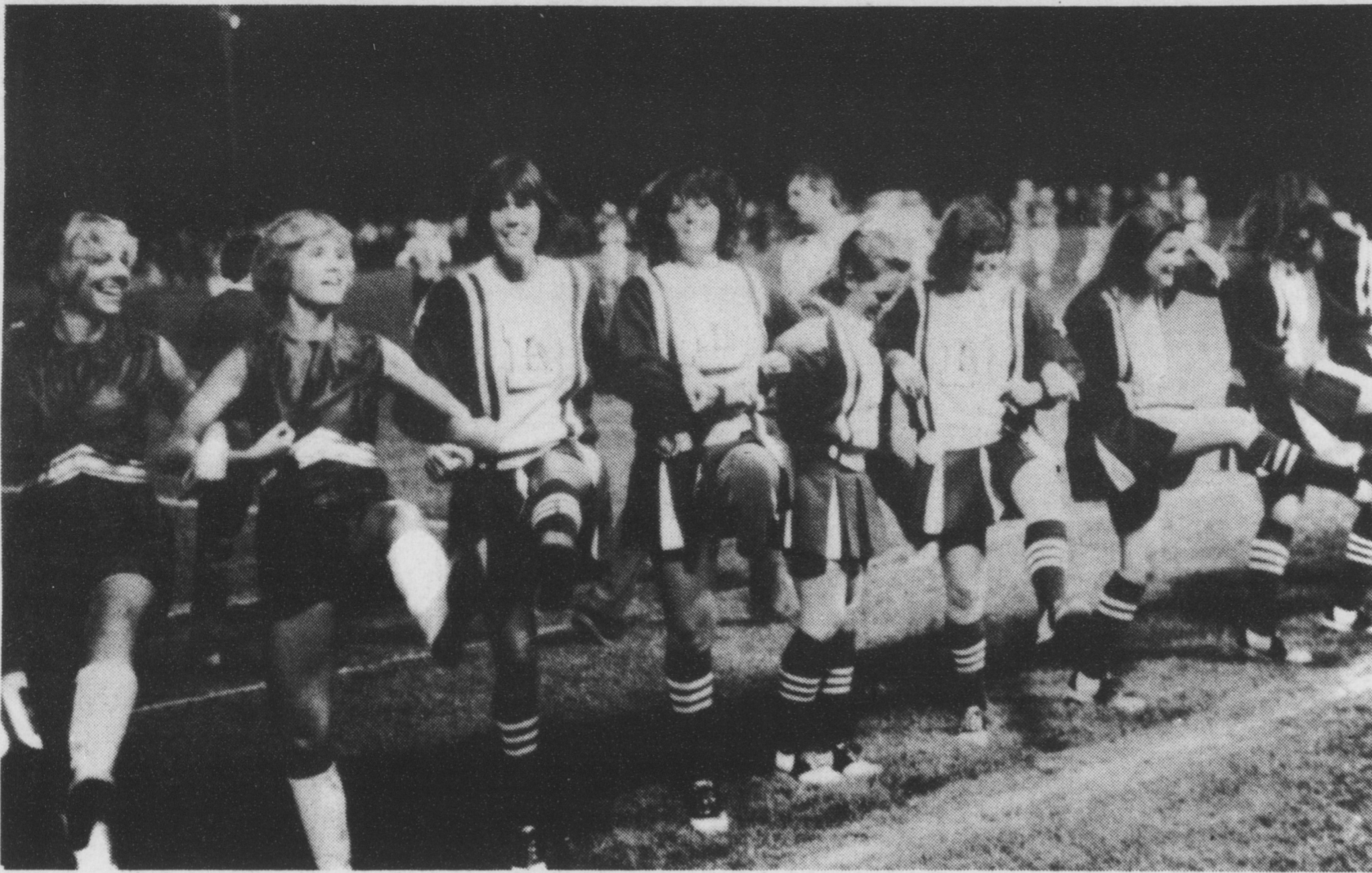
Cheerleaders and majorettes react to a touchdown