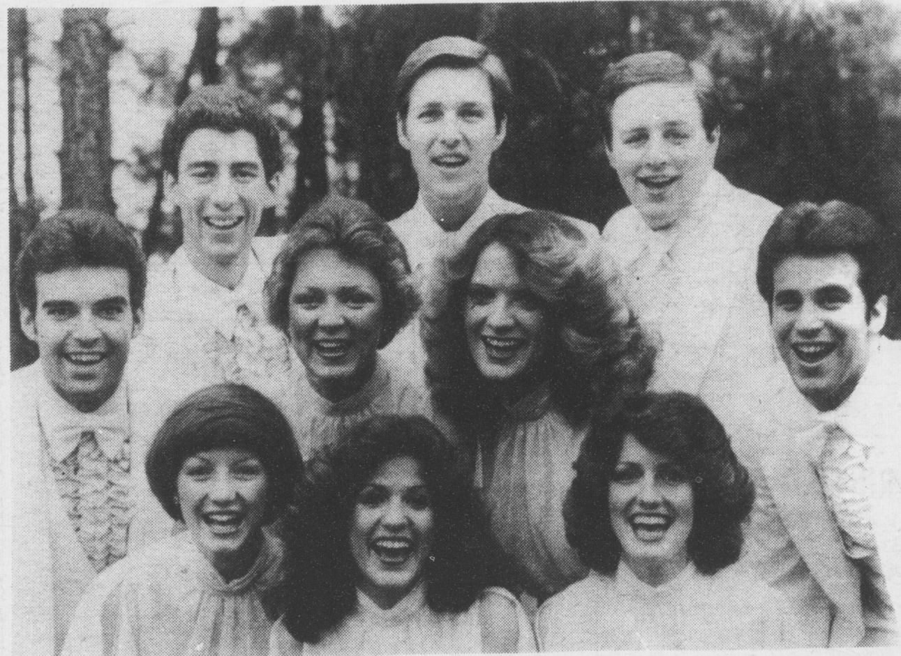
"Re'Generation," a Nashville-based gospel singing group, will make more appearances celebrating their tenth year on the road than any other group, with over 500 concerts scheduled before one million people in the next 12 months. Singing songs of faith and freedom, they will perform Thursday, September 18, at Cross Roads Brethren in Christ Church, Mount Joy, at 7:30 pm, sponsored by Florin Church of the Brethren, Mount Joy Mennonite Church and Cross Roads Brethren in Christ Church.

The public is invited to attend all services.