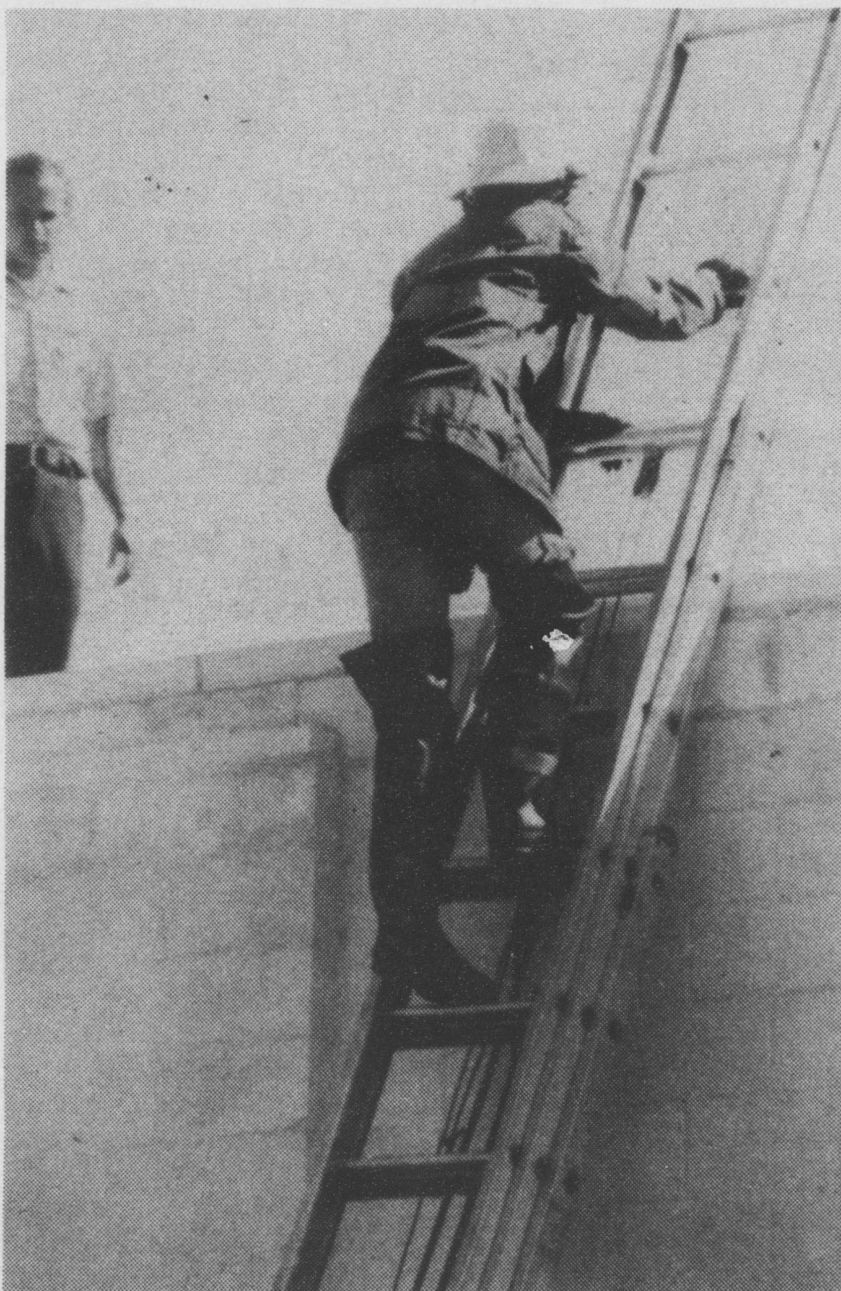
A Florin fireman leads his team to a victory in the ladder and rescue drill at the annual Zone 7 Field Day Competition.