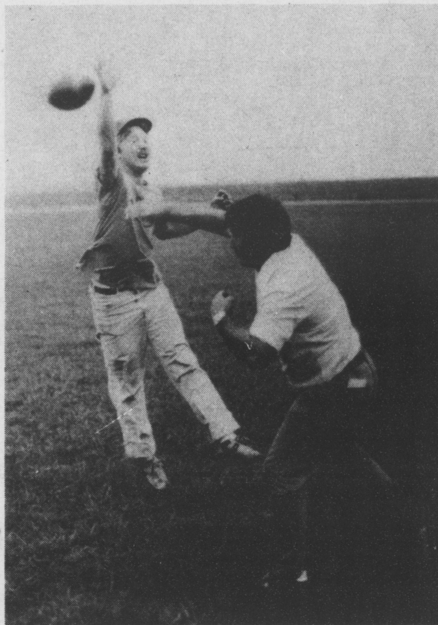
Passing is part of the alumni game

The fourth annual Donegal alumni soccer and football games will be held this Friday, August 22, at the Donegal High School. The soccer game will begin at 7 pm and the football game at 8:30 pm.