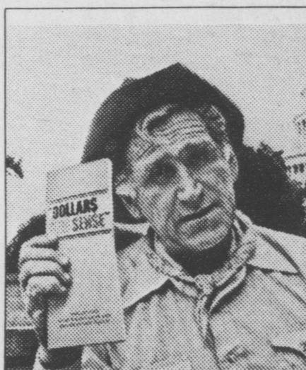
James Whitmore as Will Rogers

Porch Sale—August 2, 9 to 5. Female clothes, cheap, sizes 3 to 10, like new. Numerous other items and novelties. 139 North Market Avenue, Mount Joy. Across from the Florin Fire Co.