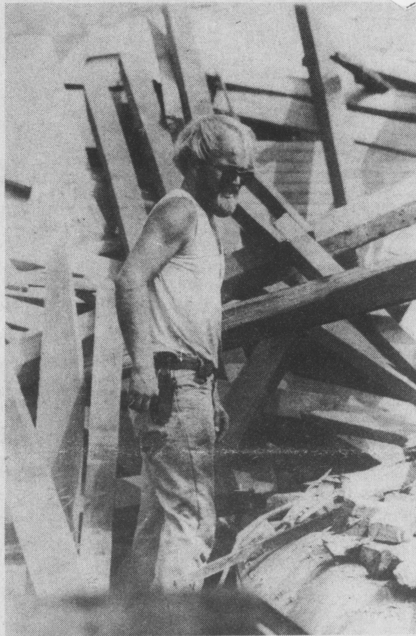
Mennonite Disaster Service volunteer stands amid the remains of the Hartzler barn deciding just where to begin the clean-up.