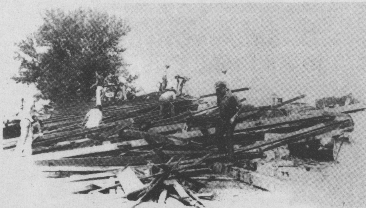
Volunteers uncover an automobile [at right] that was in the barn destroyed by Wednesday's storm.