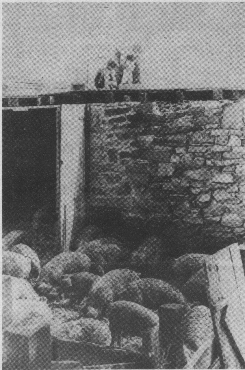
The pigs don't seem to mind the noise of the workmen overhead.

RALPH M SNYDER R.D. 2 BOX 3040 MOUNT JOY, PA. 17552