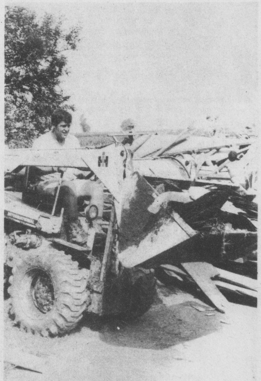
Vehicles and equipment are all part of the day's service. Here debris is hauled away from the site of the destroyed barn.