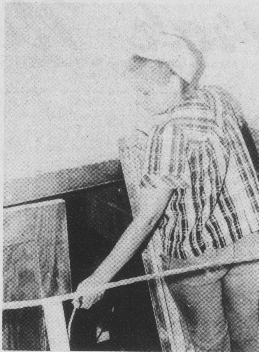
Painter works on the interior of the Marietta Jaycees' Center.

She is survived by three nieces and one nephew.