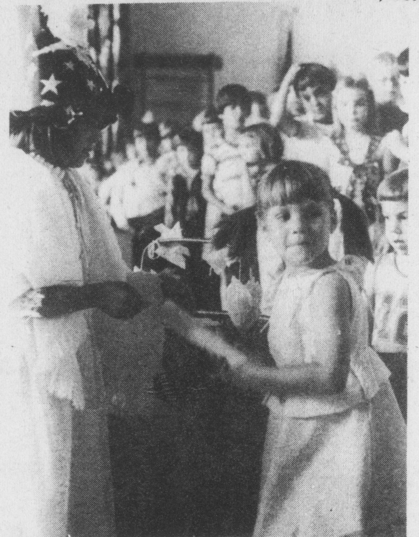
A Grandview Kindergarten student receives her "Bachelor of Rhyme" from Mother Goose at graduation exercises held Thursday, May 29.

If your club or organization would like to participate in the festivities, mail request to Marietta Jaycees, Box 122, Marietta, PA 17547, or contact any Jaycee member.