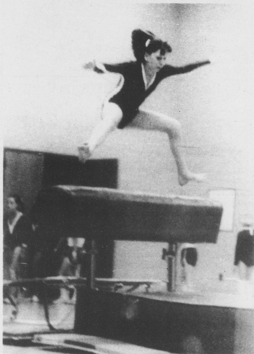
This student performs a vault on the horse as part of last Thursday evening's PACT program at Riverview.