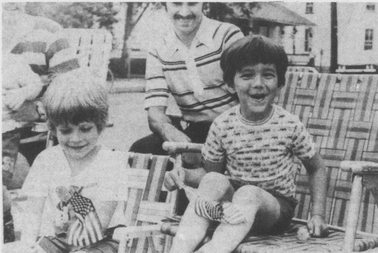
The two young boys here wave their flags while awaiting the beginning of the Mount Joy Memorial Day parade held last Saturday. For more photographs of the parade, as well as the parades in Marietta and Maytown, see pages 8 and 9