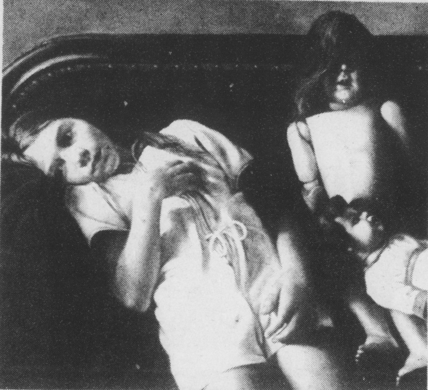
One of Wise's paintings entitled "Doll House"