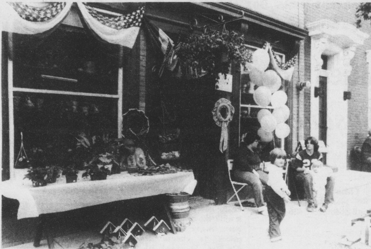
Balloons, banners, arts and crafts decorated the streets of Marietta last Saturday for the annual "Historic Marietta Day."