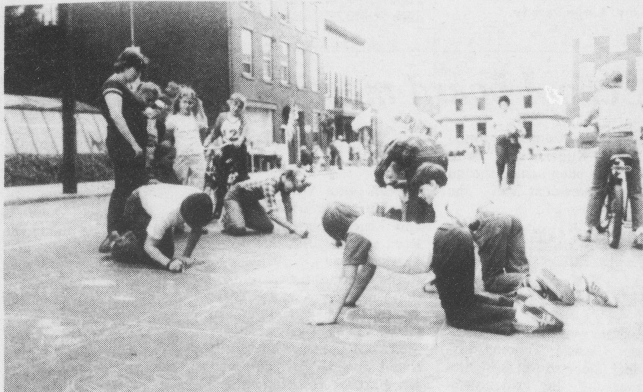
Children had a ball writing on the streets for the street drawing contest, a part of the festivities of "Historic Marietta Day"