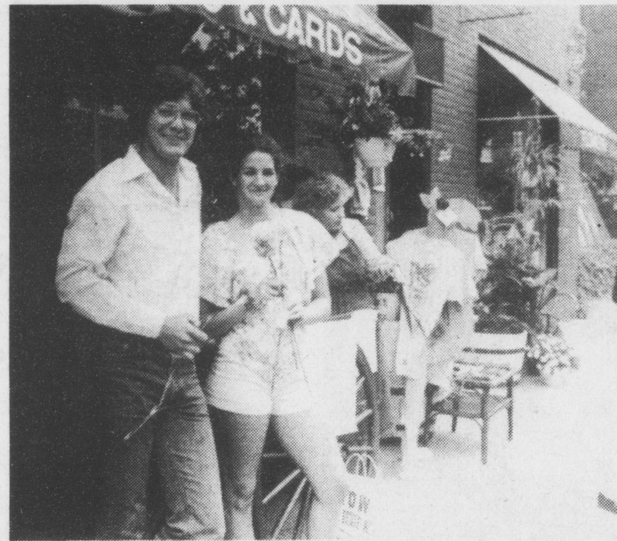
Flowers and gift ideas decorated the streets.

In seventh grade the students learn a bit about construction, surveying, mapping and community planning. They also do some block and brick laying and build the foundation for the eighth graders' modules.