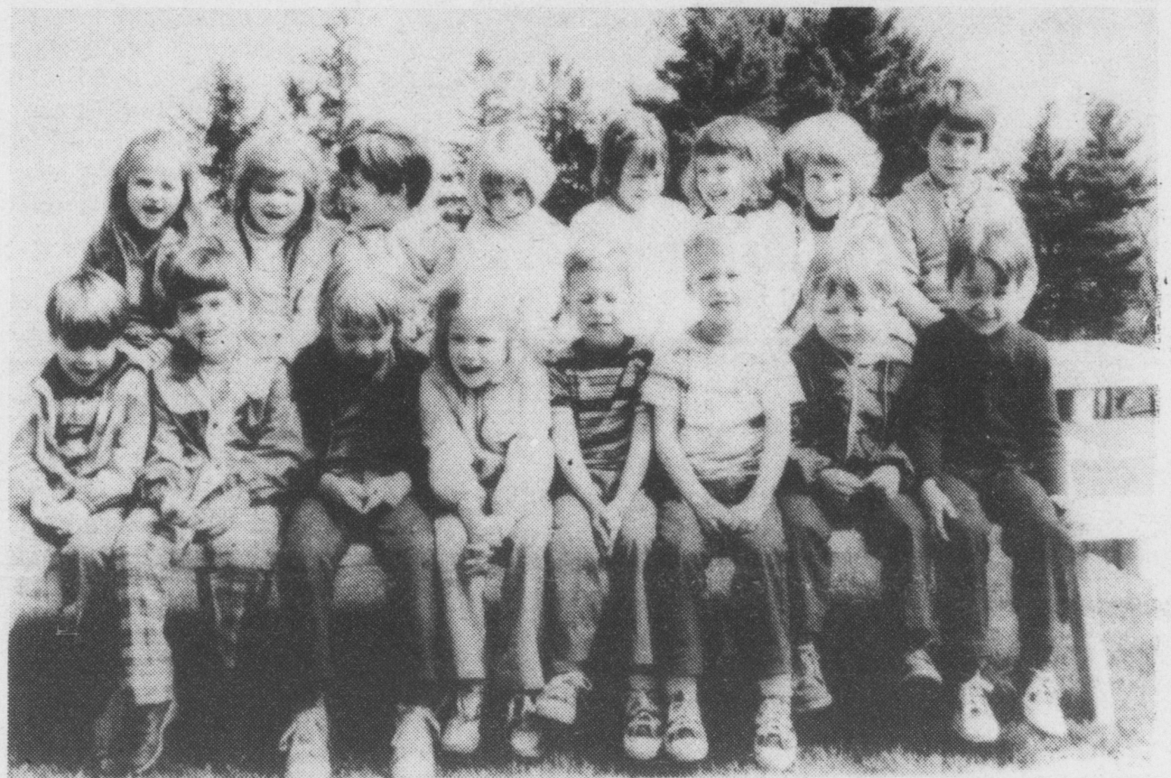
Students at Little People's Co-Op Nursery School, Mount Joy.

We at the Susquehanna Times wish all mothers a happy Mother's Day.