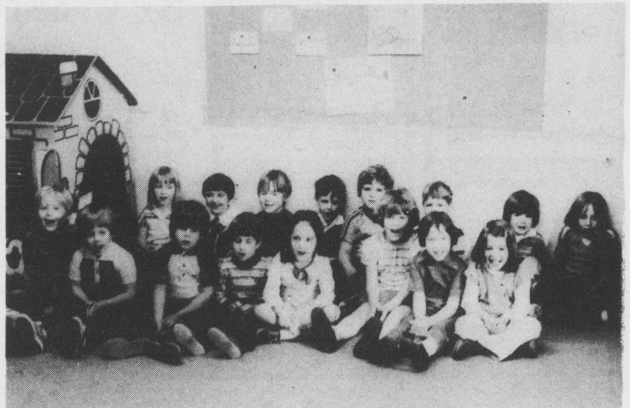
Students at Zion Lutheran Nursery School, Marietta.