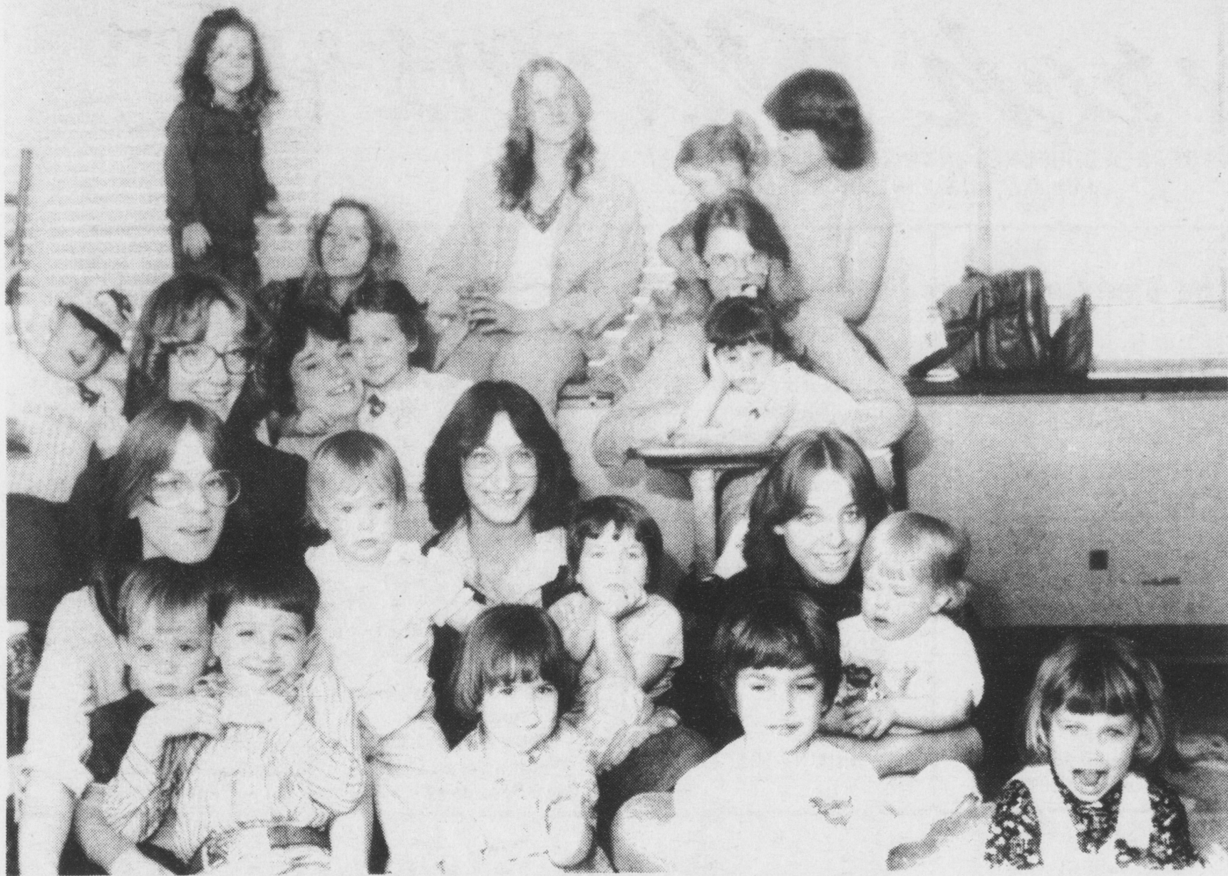
Home-ec class members with their young charges