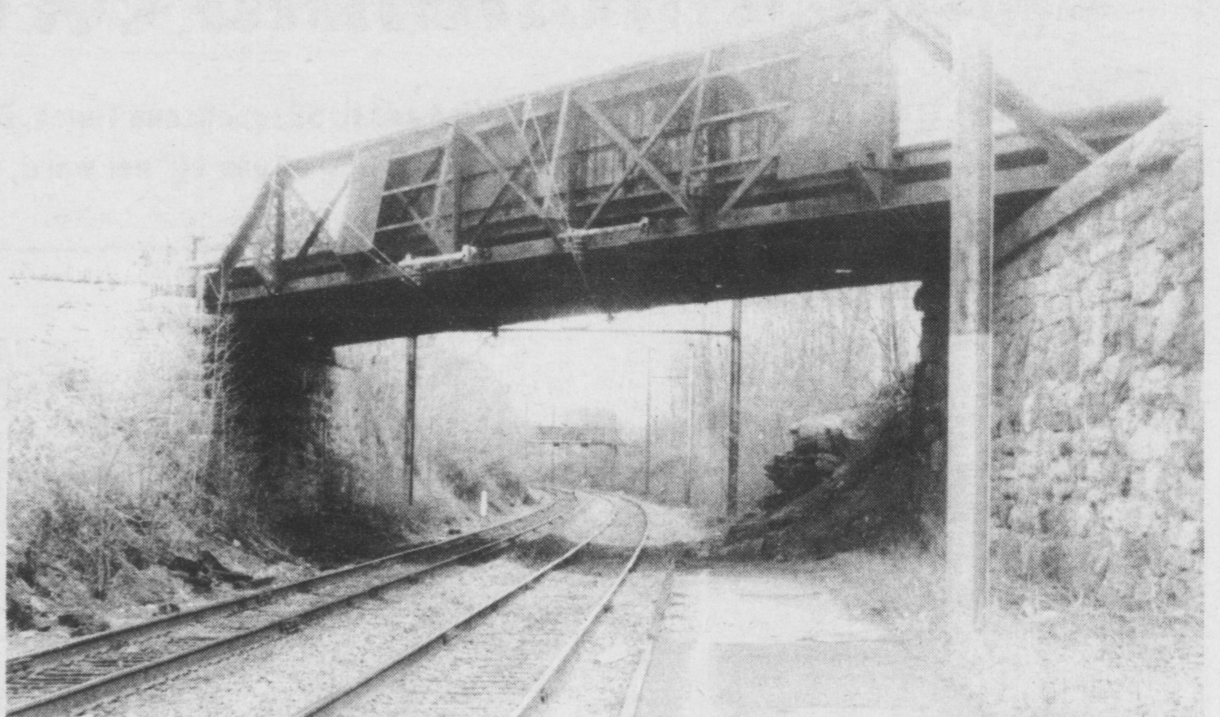
This is a view of the Marietta Avenue bridge from the railroad track below. The one sidewalk on the