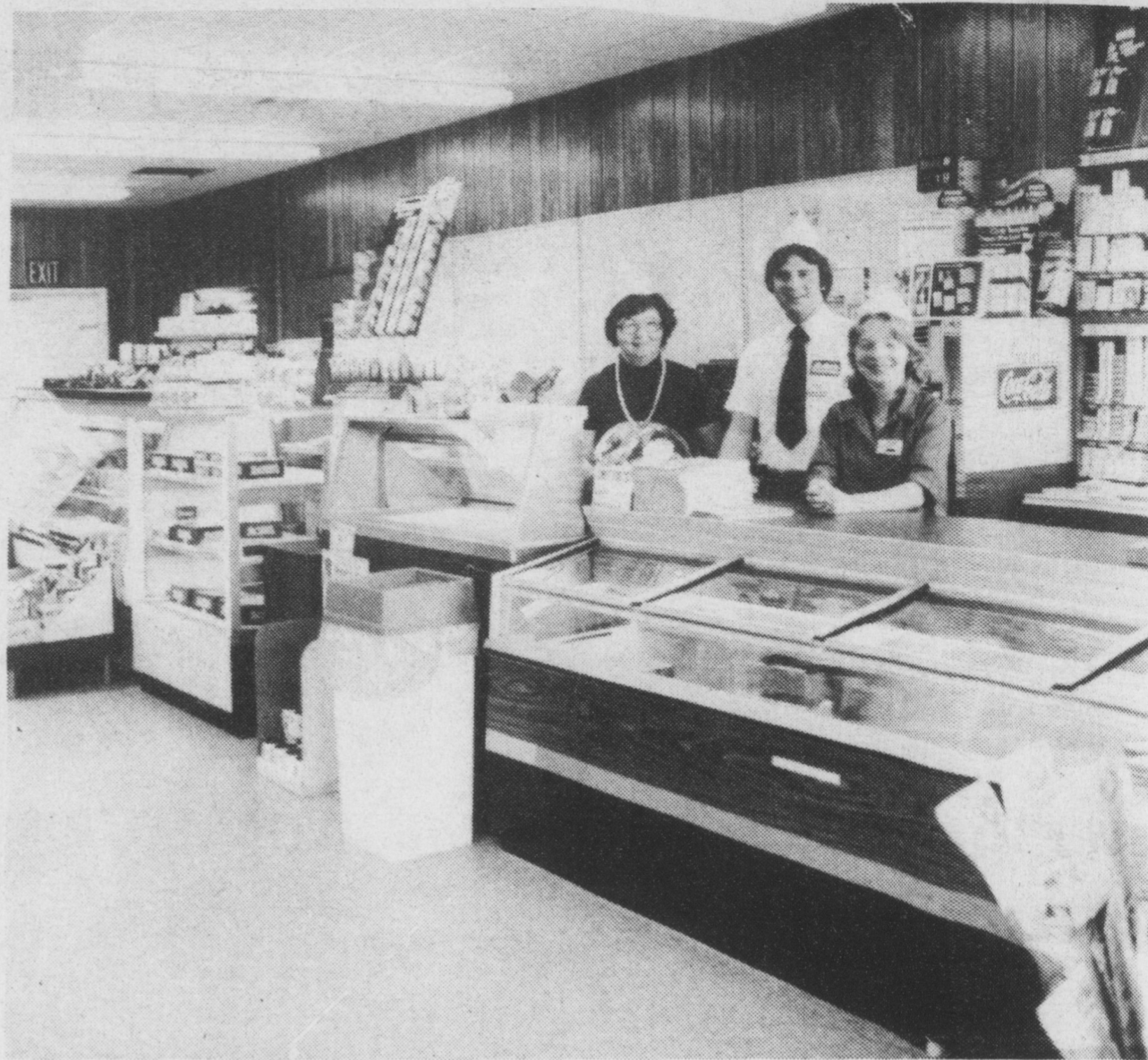
Employees stand behind the counter of the new Rutter's Farm Store located at the corner of Rt. 441 and Bank Street. The store is celebrating its grand opening this weekend.

All men and women athletic participants interested in coming to the banquet must contact their team captain or call Mike Lippold before March 30, 1980.