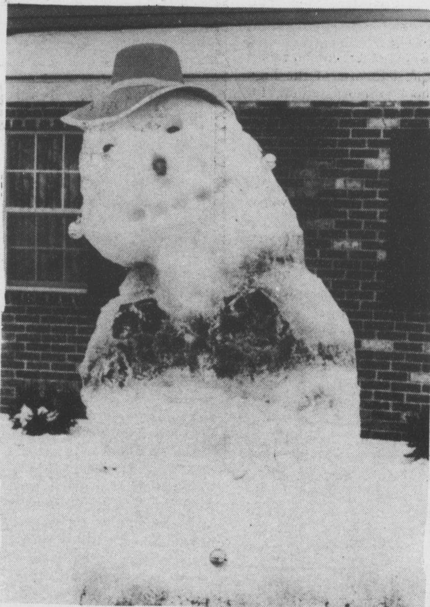
With spring just around the corner, the snow last Friday caused some comic reactions. Students living on Creekside Lane, Mount Joy, enjoyed their unexpected holiday by decorating a snowman [woman?] accordingly. In this photo she shows off for our photographer in her beach hat and bikini.