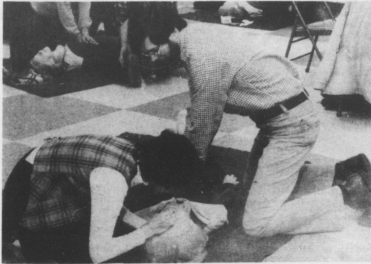
Students at Jaycees' CPR course practicing on a dummy.

The Central Savings & Loan Association Board of Directors and its management consists entirely of local people, all of which will continue to serve in the best interest of this area.