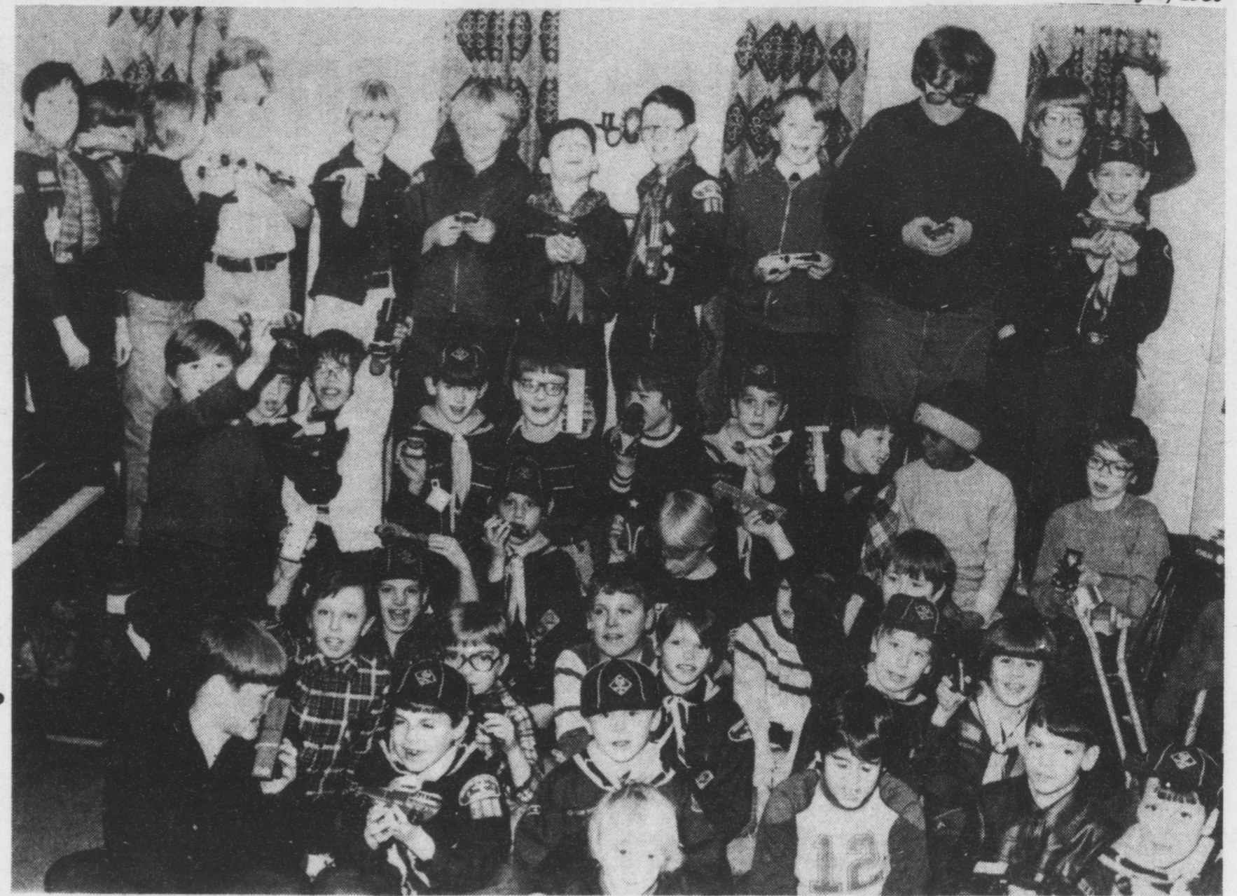
Members of Marietta Cub Pack #150 show off their Pinewood Derby cars.

Property owners in the Marietta area received instructions from Borough Council recently concerning the new garbage and trash collection rules. Beginning this month, a maximum of four containers per week may be placed at the pick-up point. This will be increased to six during the months of June, July, August and