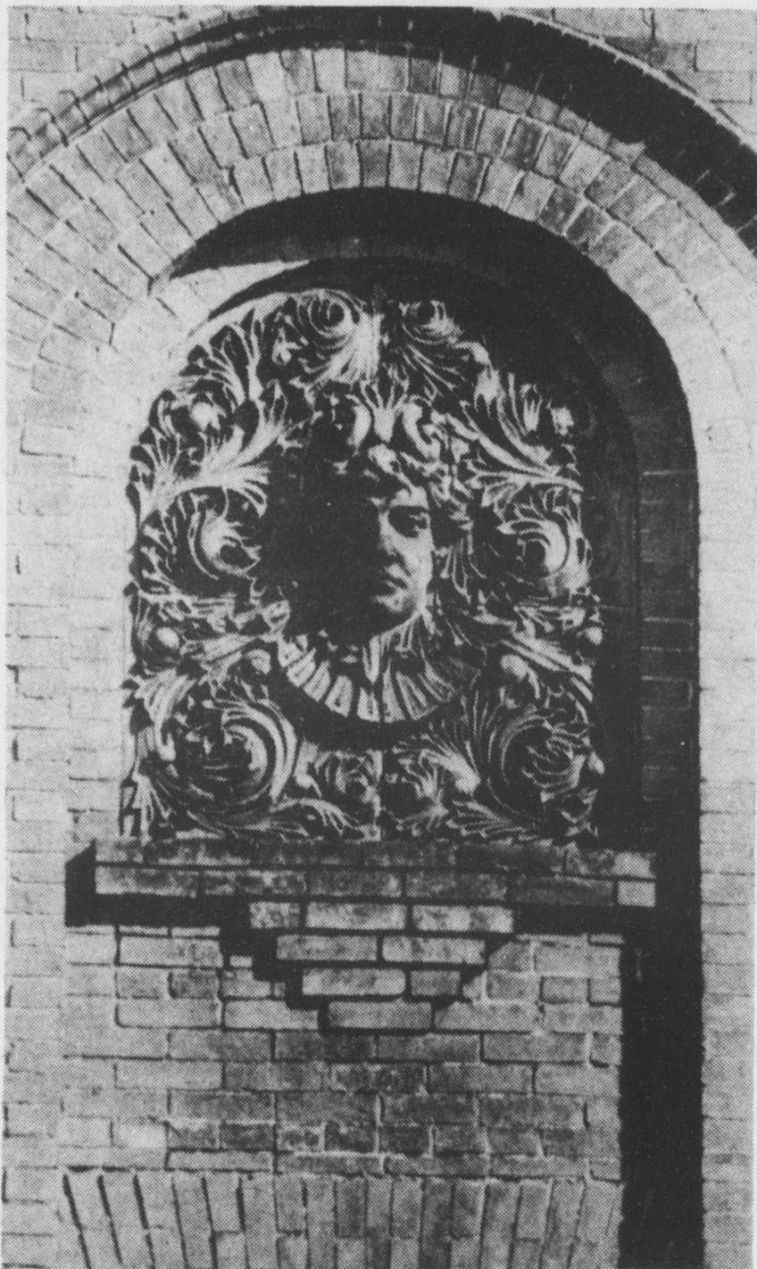
The Patron Saint of fire prevention before she was removed from her position at the old fire house. She will be a part of the new building.