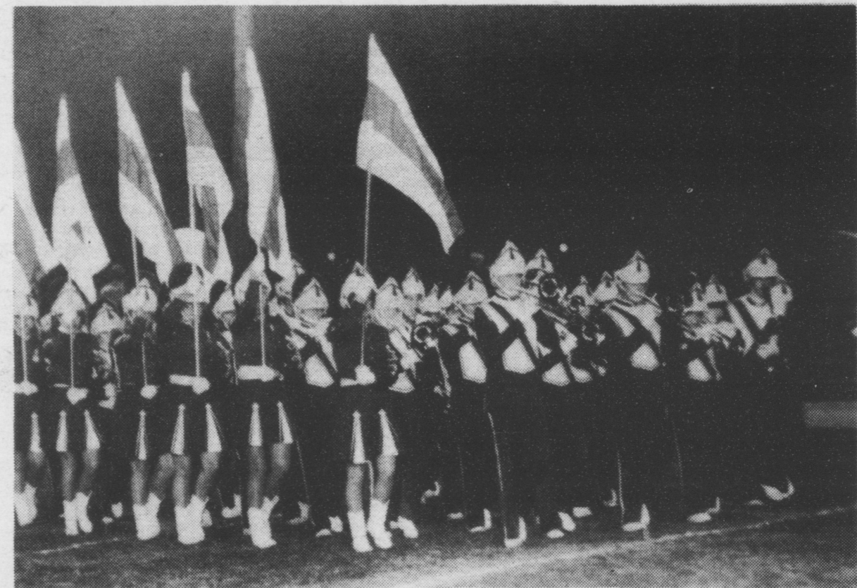
The band prepares for their half-time presentation

What he says with most determination, however, is, "We have to establish some offense."