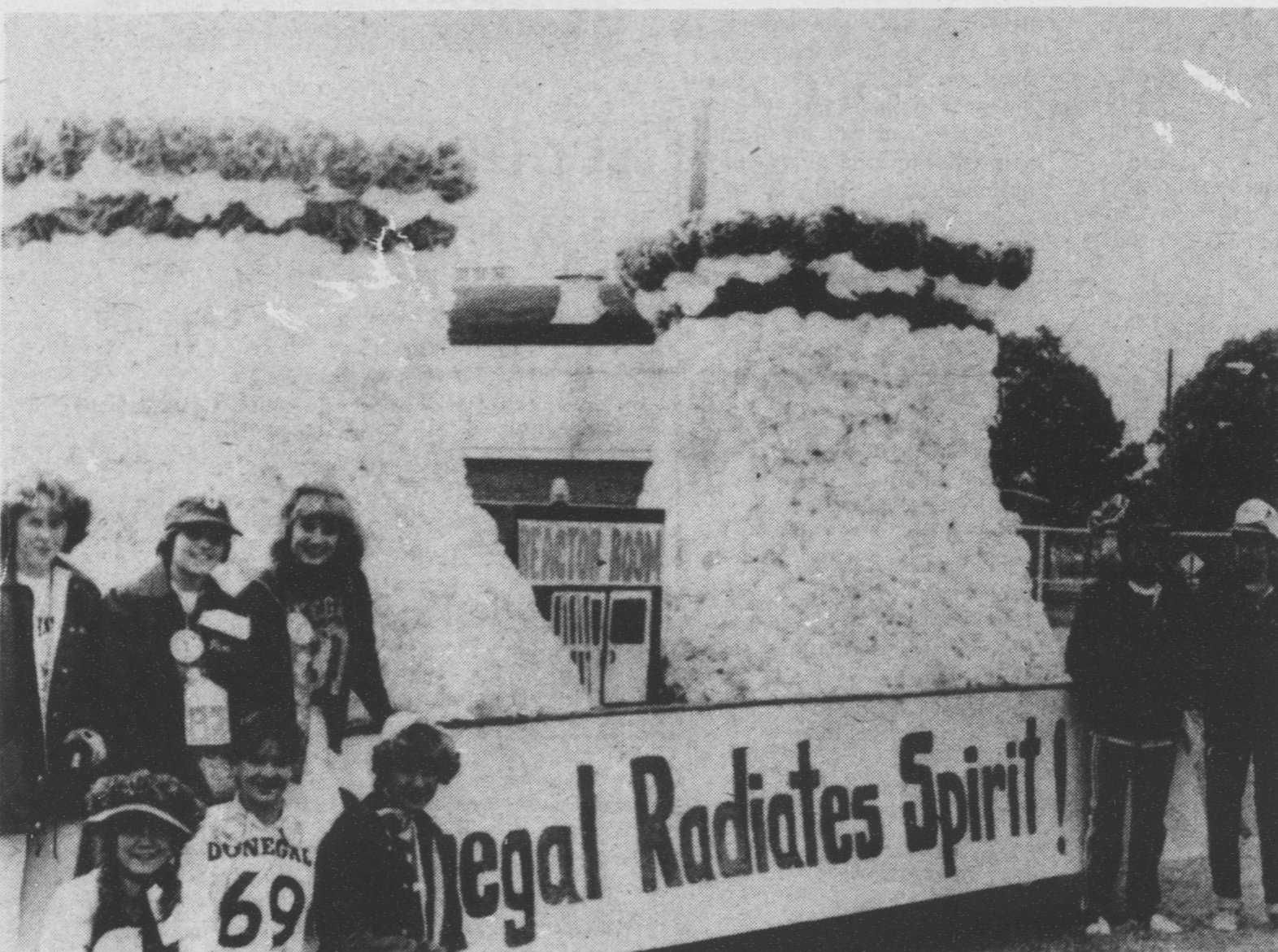
The sophomores had the winning float in this year's competition, a take-off on the TMI incident