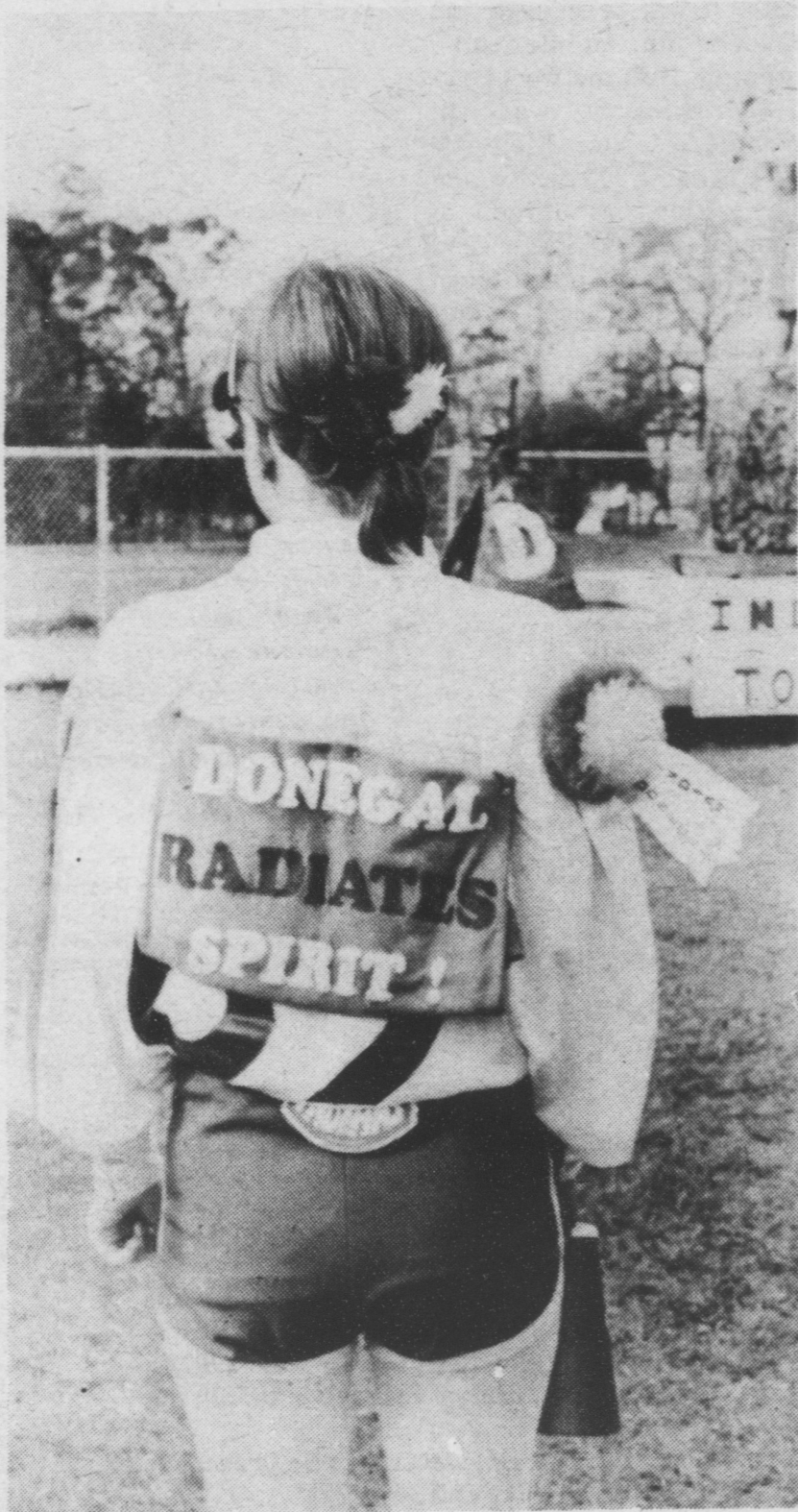
Spirit was running high during the Donegal Pep Rally