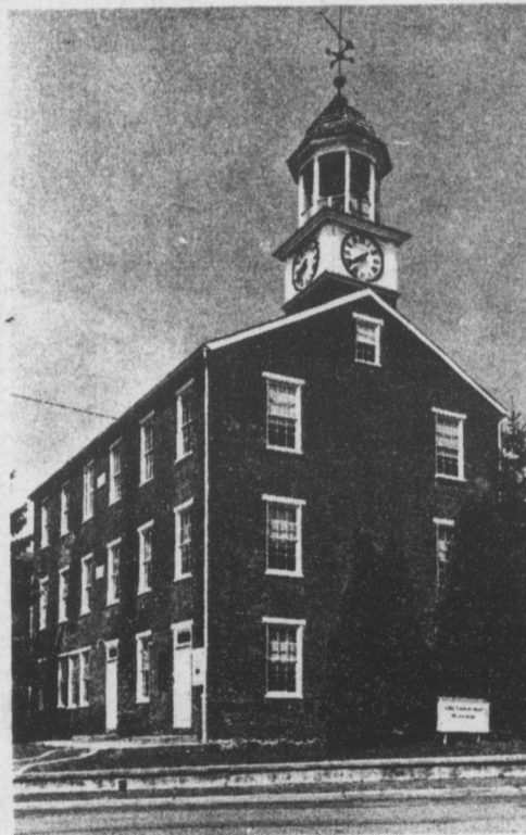
The Old Town Hall in Marietta was built in 1847. It illustrates the continuity of late Federal taste into the early Victorian period.

The book includes several photographs of local interest. They are included below.