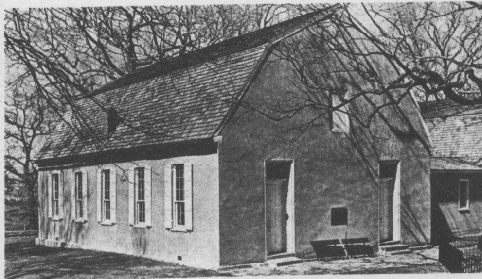
The Donegal Presbyterian Church is also a fine example of traditional English architecture. Built about 1740, the gambrel roof and the basic form of the building show Irish influences.