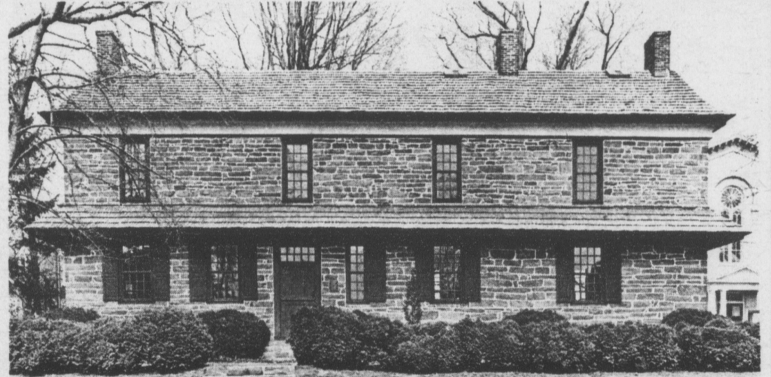
The Wright's Ferry Mansion at Second and Cherry Streets, Columbia, is one of the best examples of a traditional English rural type house. The structure is long and narrow, with an interior depth of only one room, a traditional English plan which dates to medieval times. The Wright's Ferry Mansion also has features which indicate Germanic influence. Included are the long, wooden shingles attached with only one nail, the squirrel tail oven at the gable end, and the encircling pent eave, [a roof-like projection between the first and second stories.]