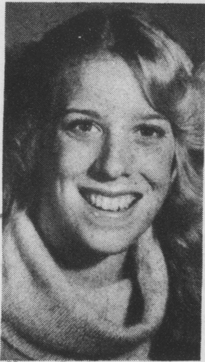
Haven St., Mount Joy.

While enrolled in the Academic Course, her Senior activities include: Concert Band; Cheerleader (Co-Captain); Colorguard; Varsity Club; Booster Club; Dramatics Club; PUFA; Senior Class Play; Yearbook Staff; National Honor Society; Hispanic Honor Society; and Who's Who Among American High School Students.