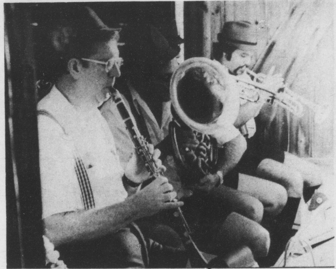
The Zimmy Schmidt Orchestra played