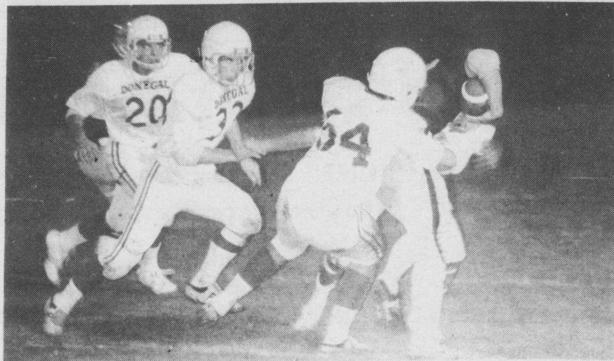
Indians in action