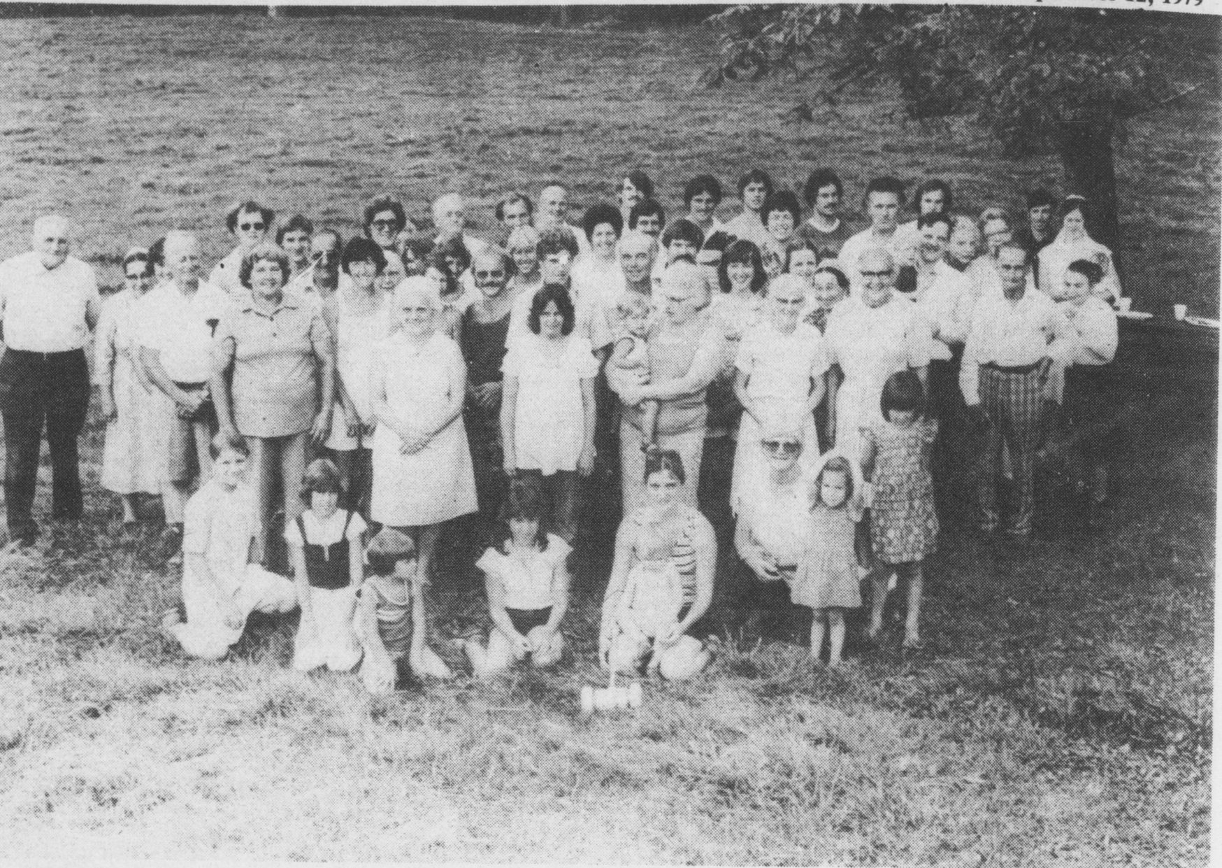
The block party just before it rained.