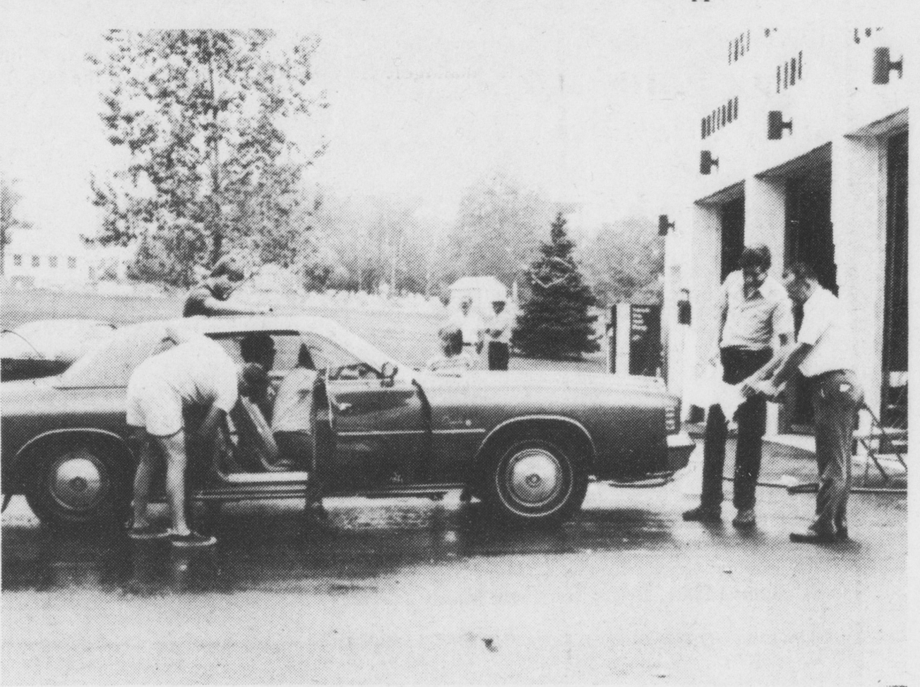
Maytown firemen washed cars last Saturday to raise money

Maytown Fire Co. members participated in the recently-held Zone 7 Field Day, hosted by Florin Fire Co. The Fire Co. holds its monthly meetings on the second Monday of every month. Prospective members are invited to attend or contact a Fire Co. member for an application.