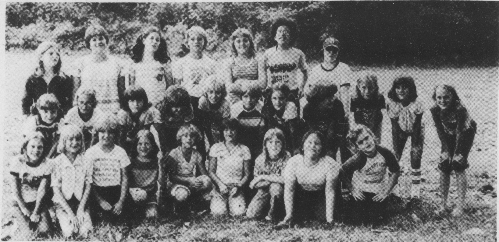
Troops 34 and 18

Marietta Brownie Troop #34 and Girl Scout Troop #18 went on an overnight