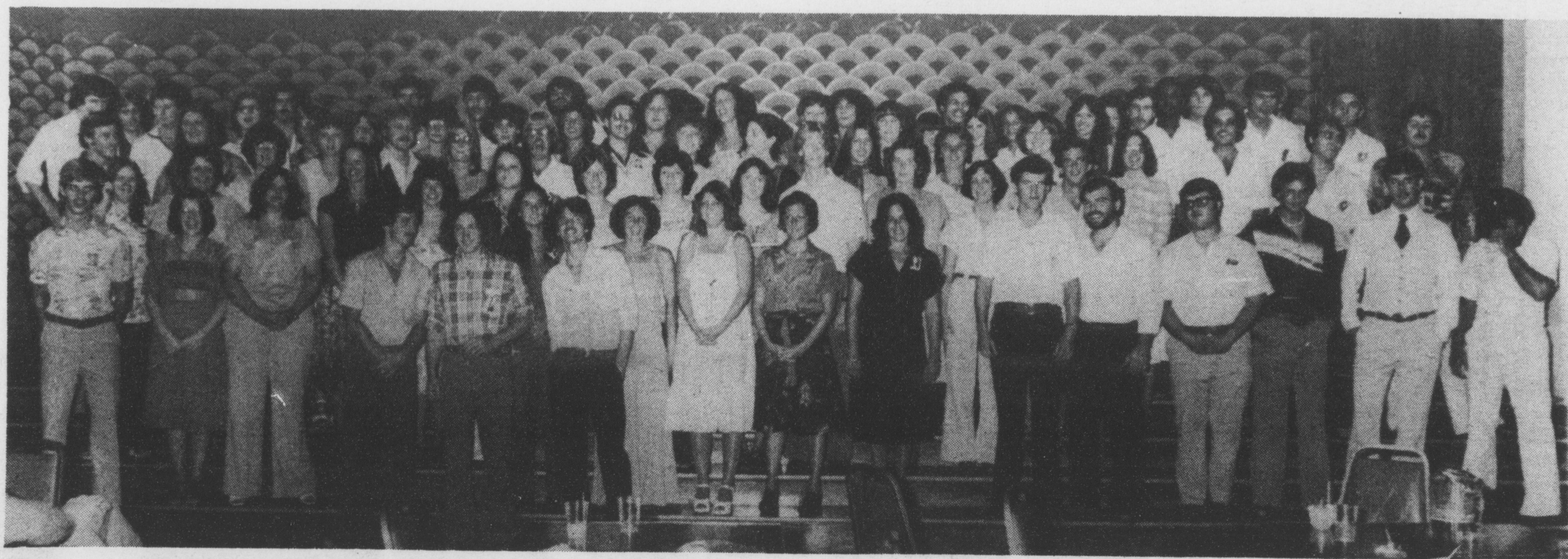
The class of 1974, Donegal H.S., at their 5th reunion at Landis Valley Resort

The Donegal High School Class of '74 held its 5 year reunion on August 4 at the Landis Valley Resort Inn, with 125 people in attendance.