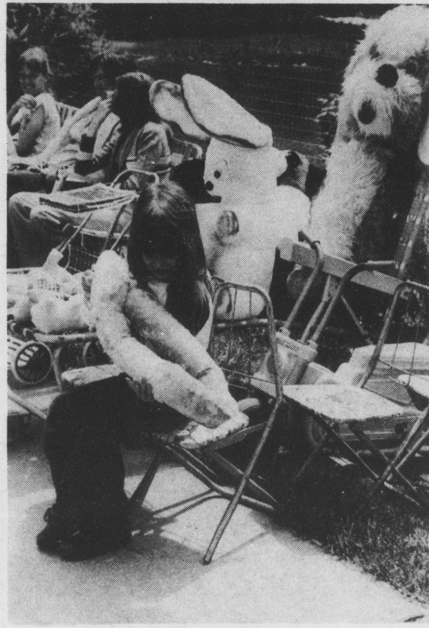
Attic and Seller Day was also last Saturday. Many Mariettans set up stands on the sidewalks in front of their homes and sold everything and anything.