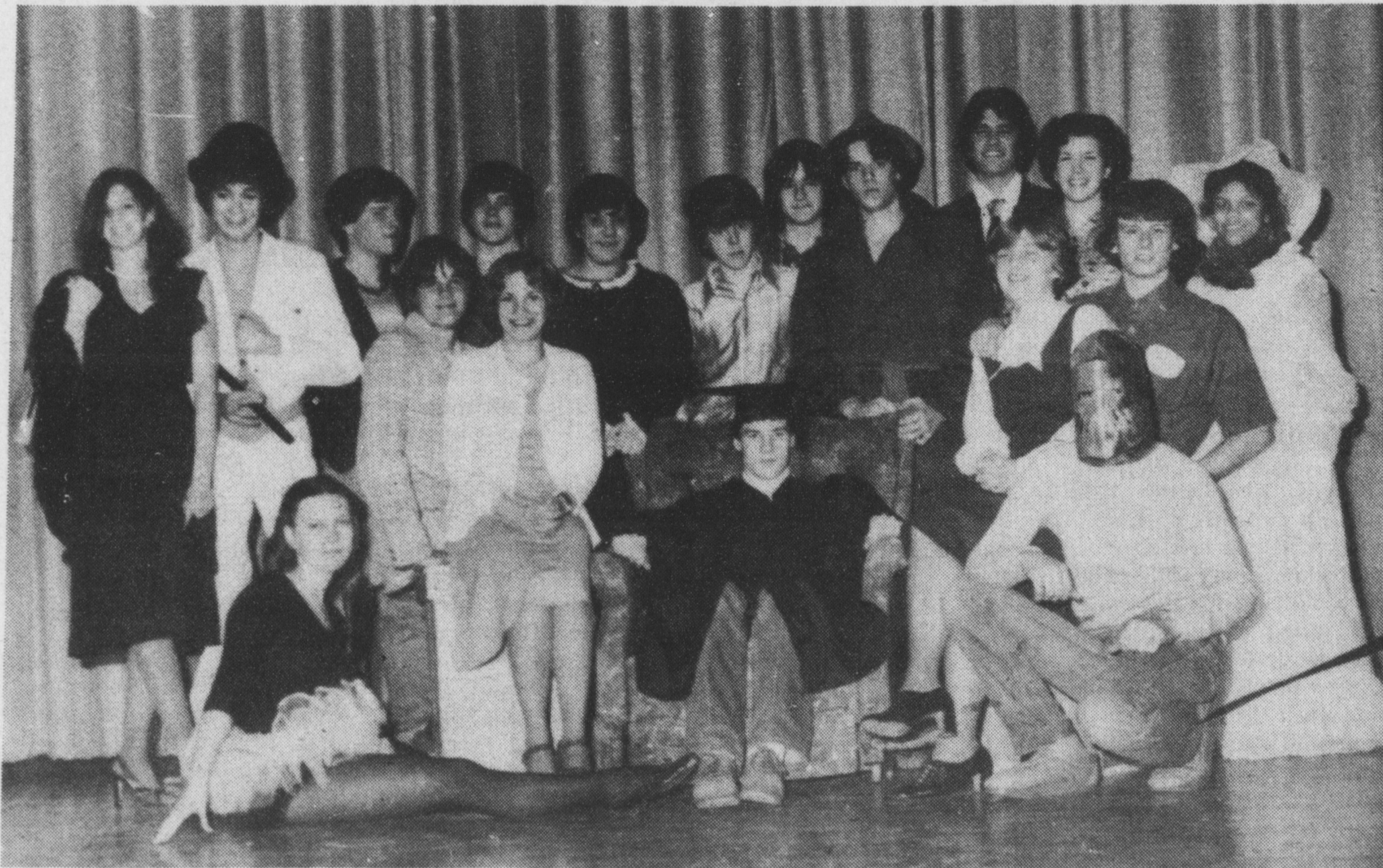
The cast of "You Can't Take It With You"

The Donegal High junior class will present You Can't Take It With You , a three-act comedy, on Friday and Saturday, March 2nd and 3rd, at 8:00 PM in the DHS auditorium. A special presentation for the area's senior citizens will be played on Thursday, March 1st, at 1:00 PM.