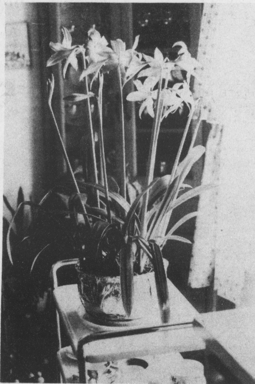
The fifty-year-old lily plant