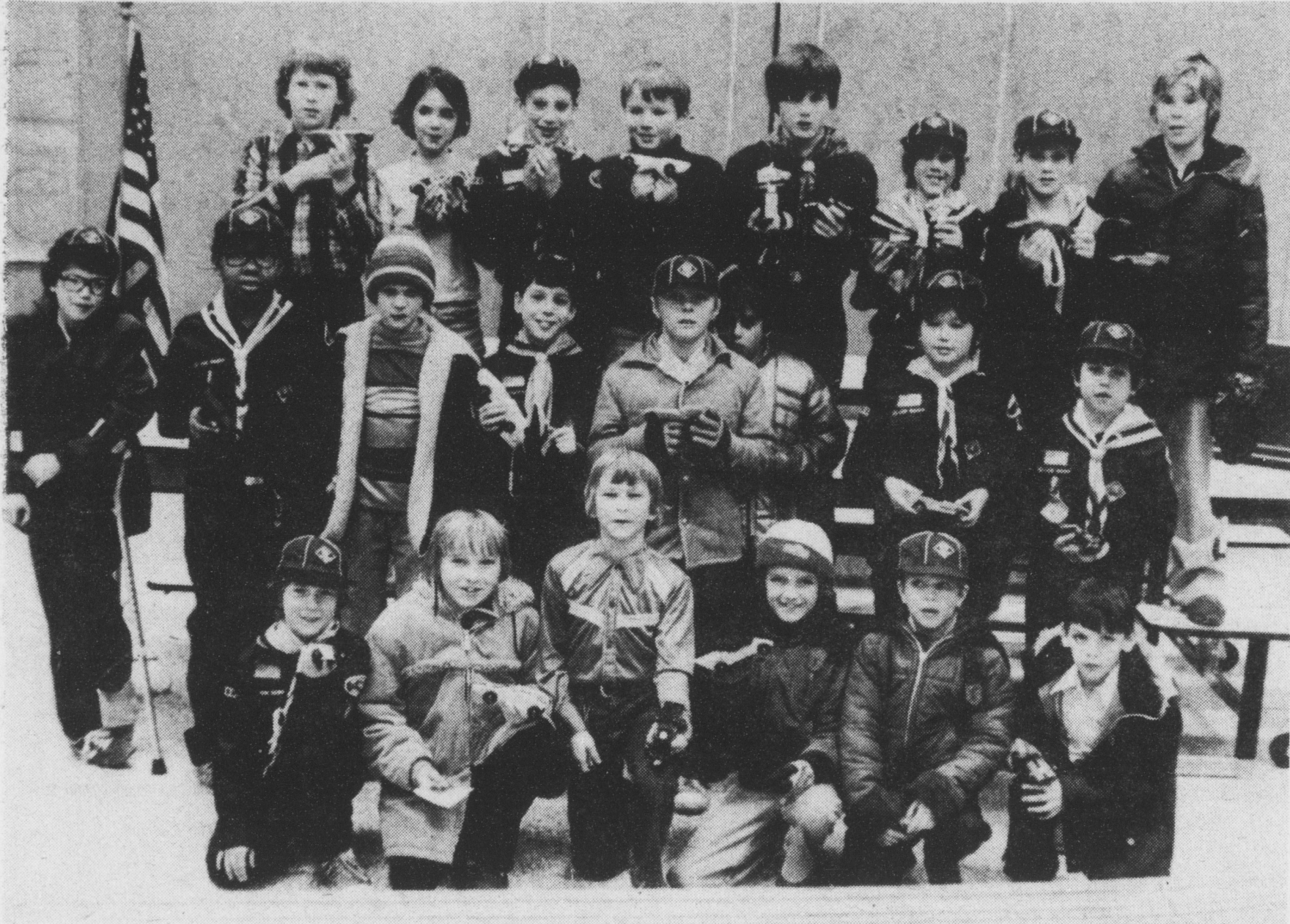
Pack 150 poses after the Derby.