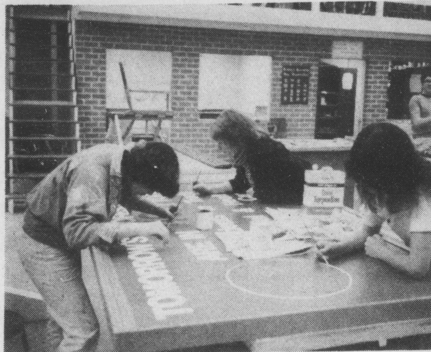
Students work at the Vo-tech.