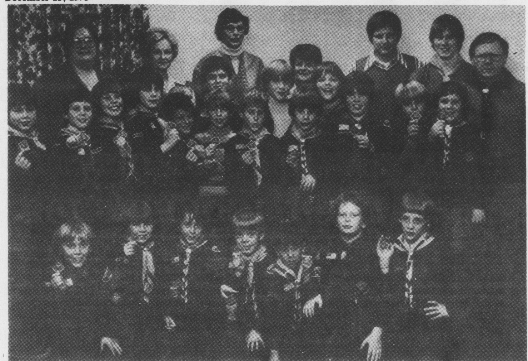
Maytown Scout Pack 53