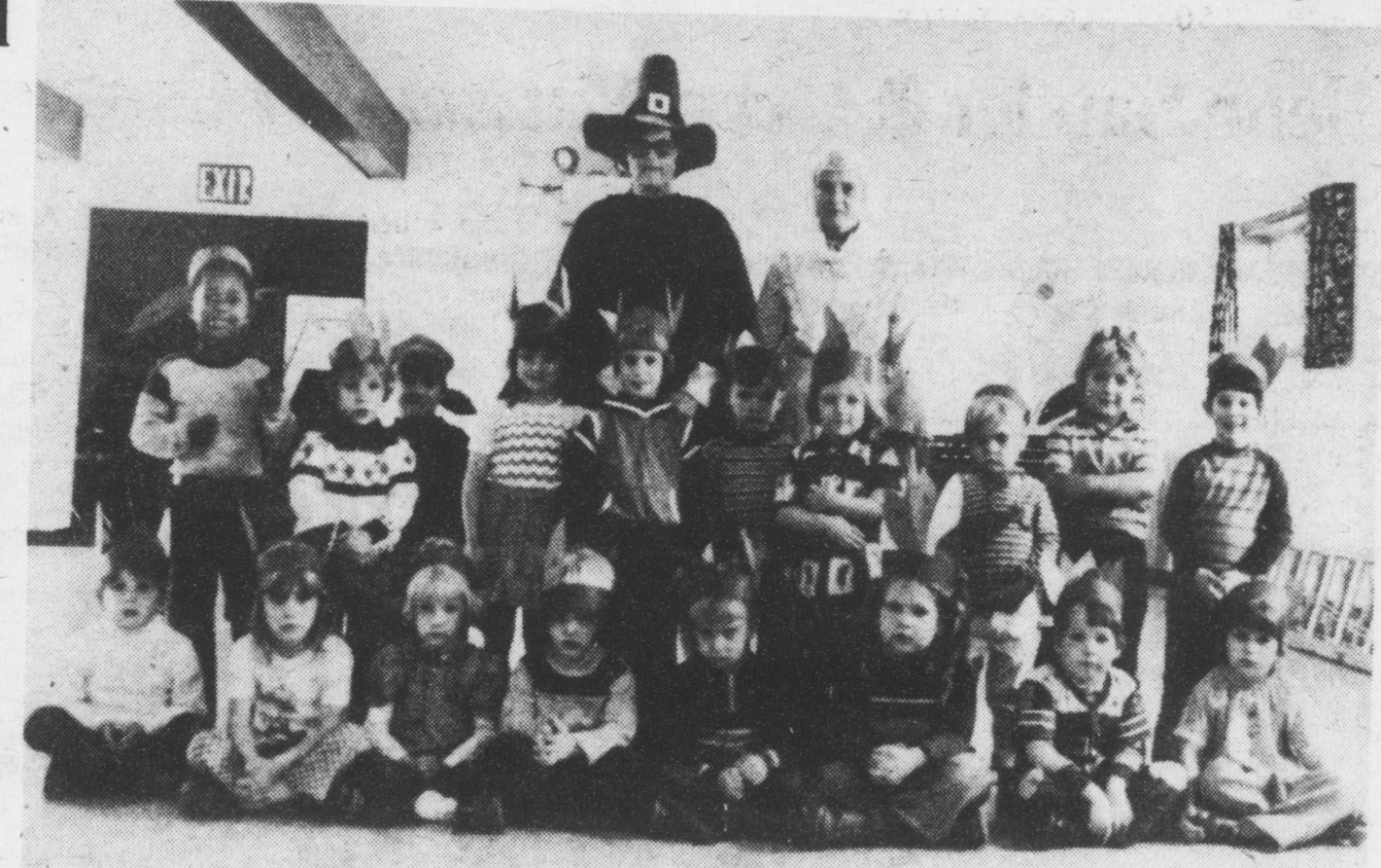
Indians and pilgrims at Zion nursery school

On the menu were popcorn maize, Indian pumpkin cookies, Plymouth Rock carrots, and pilgrim