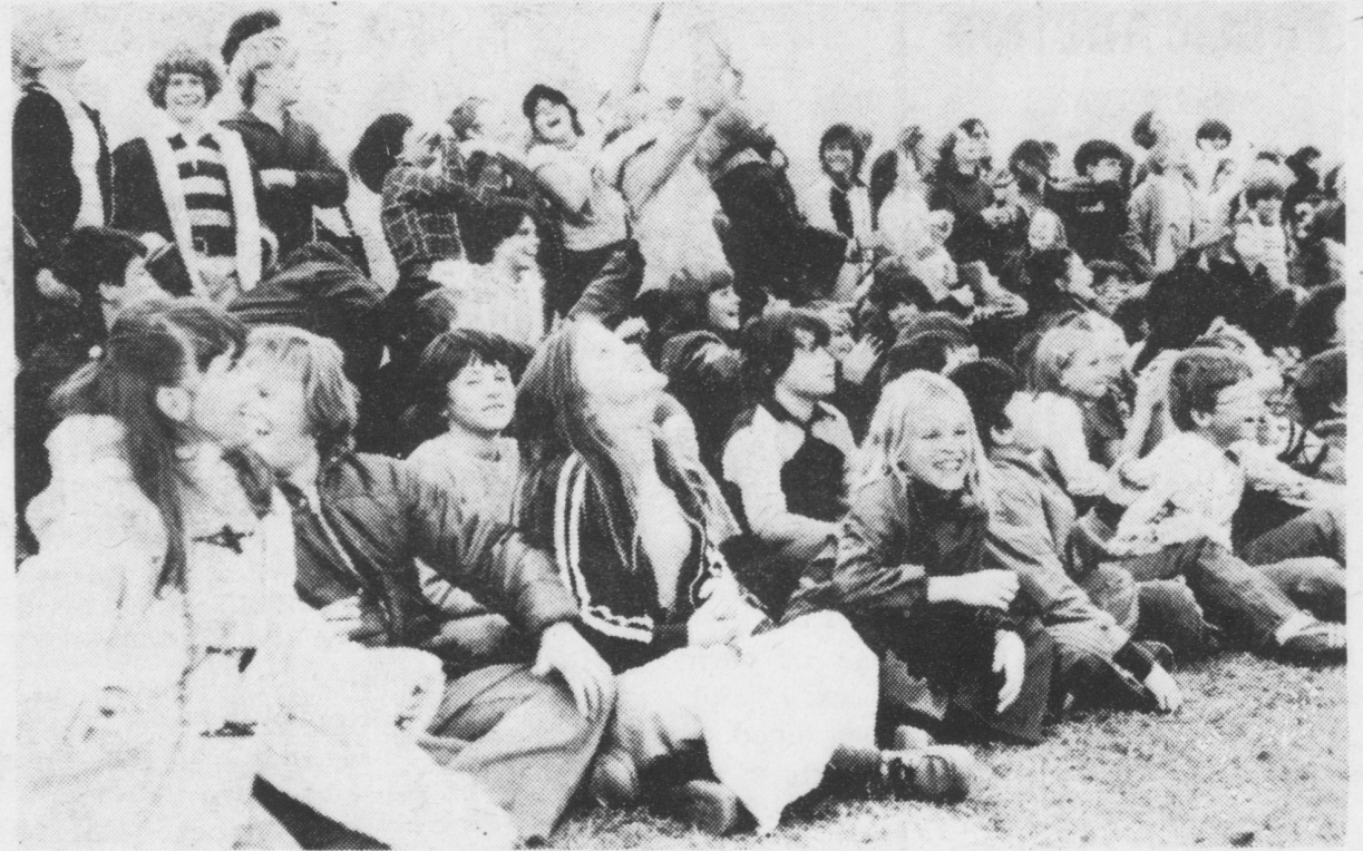
hot-air balloon works. Gusting winds made it unsafe to take off, but the students got a big thrill out of watching the giant balloon inflate.