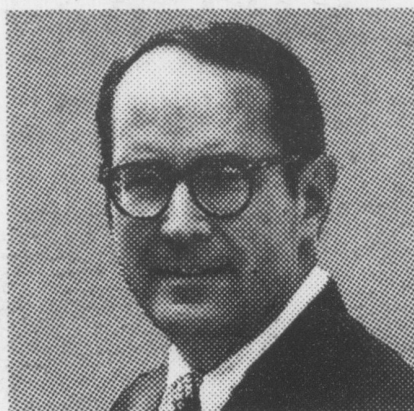
DICK THORNBURGH Governor