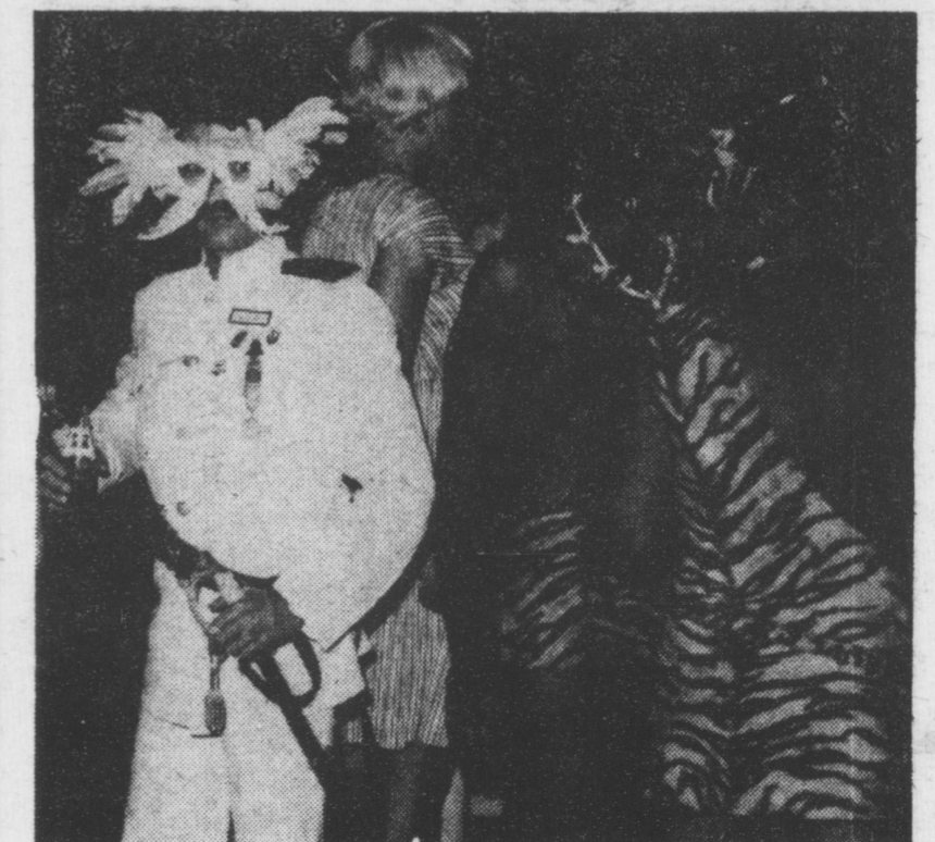
Showing the colors at the Trasha Ball