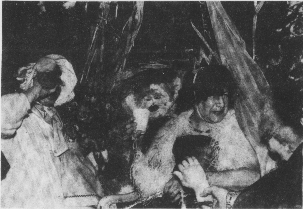
The new Trasha Queen, center, and her attendants

Historic Preservation officer visits Marietta for Trasha Ball