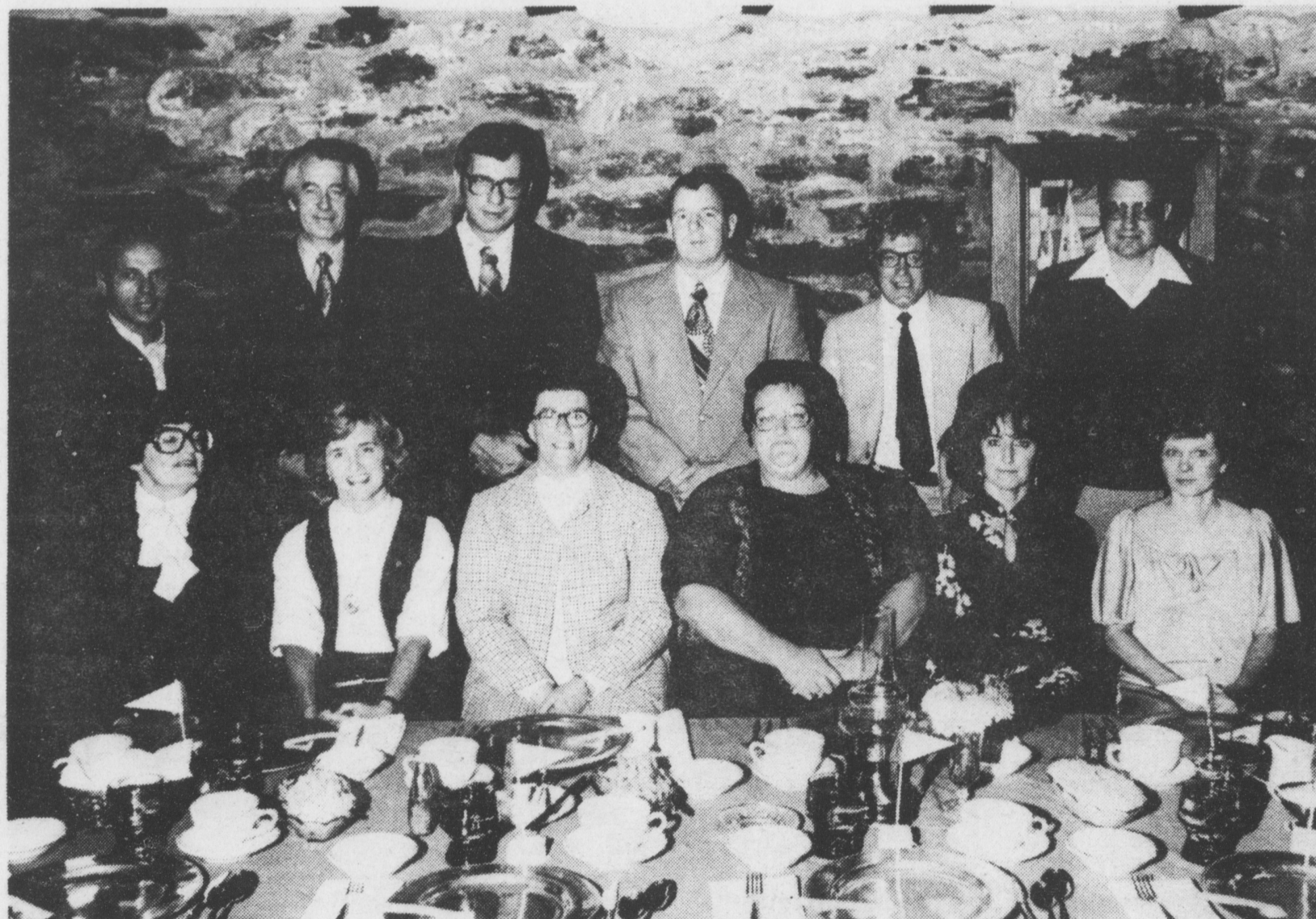
The Marietta High School Class of 1952 gathered at Groff's Farm Restaurant last week for their 25th reunion.